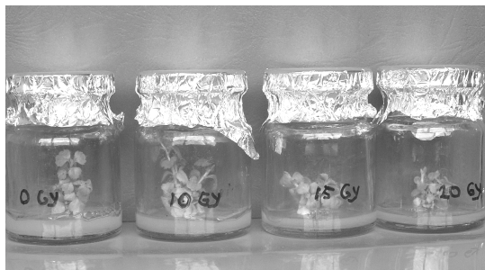
Fig. 3. The effect of irradiation doses on chrysanthemum explants growth (M1V0 generation) (left to right: 0, 10, 15 and 20 Gy).

The percentage of surviving explants both in the second and the third subcultures decreased significantly along with the increase of irradiation dose (see Table 3). The multiplication rate of control and explants exposed by 10 Gy was the same as results reported by Carson and Leung [14] in experiment on Leptinella nana L. in-vitro culture, i.e. four to five explants per shoot multiplication rate, which was sub-cultured every 3 weeks on MS medium. The number of shoots produced on 10 Gy dose explants was a little higher (Fig. 3).