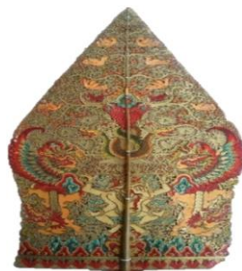
Figure 1. Wayang Gunungan

Gunungan in performances or performances of wayang kulit purwa has a vital role; from the beginning (talun) to the end of the show (tancep kayon), always use gunungan. The shape of the mountain (Gunungan) is very distinctive, so it is easy to recognize and memorize the shape of a tapered mountain, such as a cone or mountain. Gunungan is also called kayon because the central element in the gunungan is the image of a tree (intelligence or wood), who called "mountains" because of their shape like a pointed mountain peak [23]–[25].