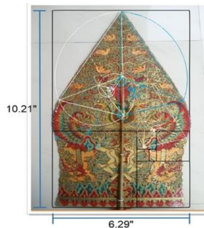
Figure 3. Golden rectangle wayang kulit gunungan

Pay attention to the figure below, which is the overall wayang gunungan or P1.