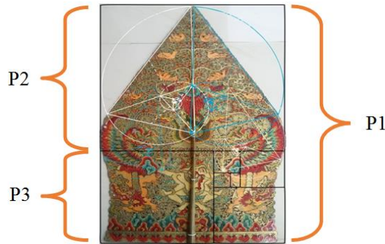
Figure 2. Golden ratio in Gunungan shadow puppets (wayang kulit)

In general, the gunungan shadow puppets (wayang kulit) can be divided into three parts, pay attention to the picture below: