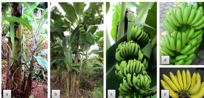
Figure 4. (a) Field performance of in vitro -derived banana cv. Ambon Kuning, 10 months, (b,c) 11 months in the field, (d) fruits at harvest time, and (e) ripe 'Ambon Kuning' fruits

In general, application of NPK (32:10:10) solution in acclimatized banana plantlets increased growth as shown by the increase in plant height and fresh weight. In addition, acclimatization media consisting a mixture of sand : compost (1:1,v/v) proved to be the best media for banana acclimatization since it produced the highest value of plant height, number of leaves and fresh weight, in both fertilized and without fertilizer treatment (Table 2). This finding was consistent with the previous