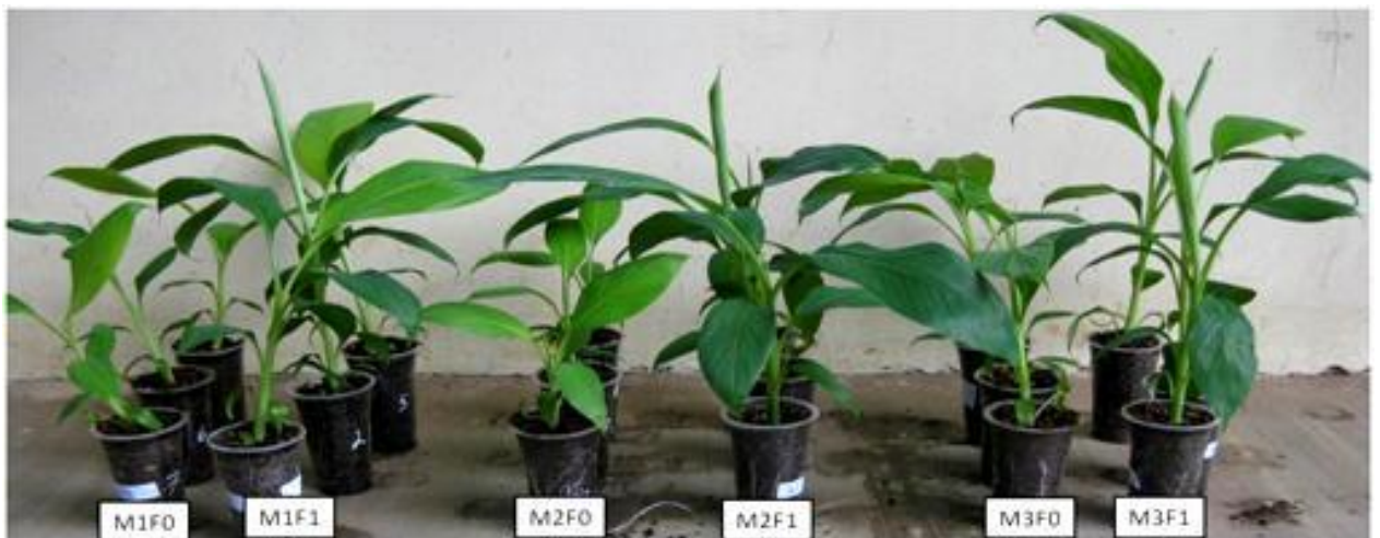
Figure 2. Eight week-old plantlets acclimatized under different media mixture and applicant of NPK solution. M1: rice husk:compost (1:1,v/v), M2: sand:compost (1:1;v/v), M3: rice husk:compost:sand (1:1:1;v/v); P0: without NPK fertilizer, P1: with application of NPK fertilizer solution

The results showed that after 8 weeks in ex vitro condition, all plantlets (100%) from all treatments were fully acclimatized (Figure 2) and ready to be transplanted to bigger polyethylene bags for full exposure to full sunshine. It was observed that both the media composition and fertilizer treatments affected growth of the plantlets.