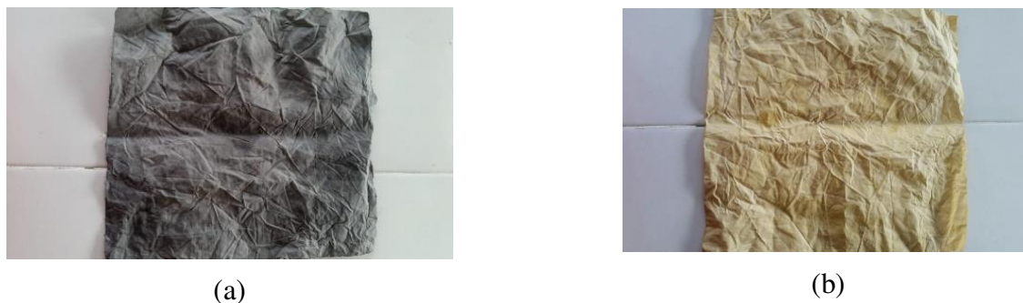
Figure 2. Photograph of dyed fabrics with: (a) ferrous sulphate; (b) alum