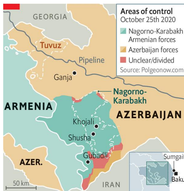
Fig. 2 – Situation in the front on October 25 (The fighting in Nagorno-Karabakh)

considered negligible. Armenia has no choice but to make concessions" (Zachary Kallenborn). Apparently, Kallenborn did not rule out that Armenia had lost more by emphasizing the "open source information". As a result of a successful operation conducted by the Azerbaijan Army in the direction of Gubadli, the units of the Armenian Armed Forces were forced to withdraw from important heights and a number of positions (Figure 2). Serious blows were inflicted on the 155th artillery regiment, the 5th mountain regiment and the 543rd regiment located in the direction of Aghdara. Newly arrived volunteers at the enemy's artillery units north of Hadrut left the firing positions and began to flee. In the Khojavend, Fizuli and Gubadli directions of the front, the enemy's weapons, ammunition and fuel depots were destroyed and important communication lines were taken under control. Most of the conscripts sent to Nagorno-Karabakh from the Tsakhkadzor settlement of the Kotayk province of Armenia perished. Numerous enemy vehicles were destroyed in different directions of the front (Heydər Piriyeu).