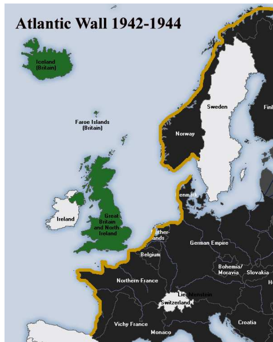
Fig. 3 – Atlantic wall (Operation Overlord & Neptune)

reassured Hitler in 1944. Thus, the Nazi army had prepared strong fortifications from the west coast of France to the coast of Norway against any possible attack by allied forces. This “Atlantic wall” was designed to protect the new German Empire from the Atlantic Ocean (Figure 3).