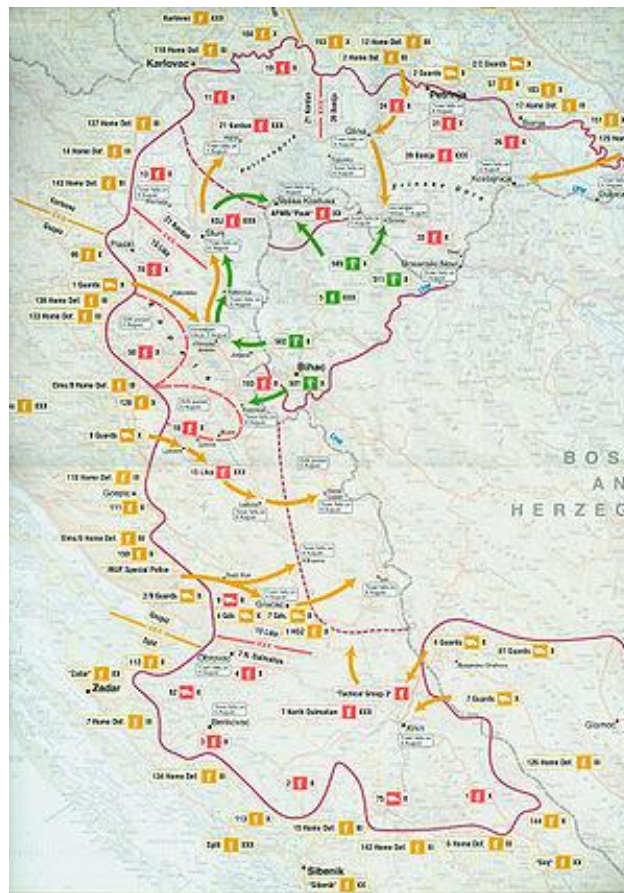
Fig. 1 – Operation Storm (Operation Storm)

as “Operation Storm” initiated by Croatian Army in August 1995 (Figure 1).