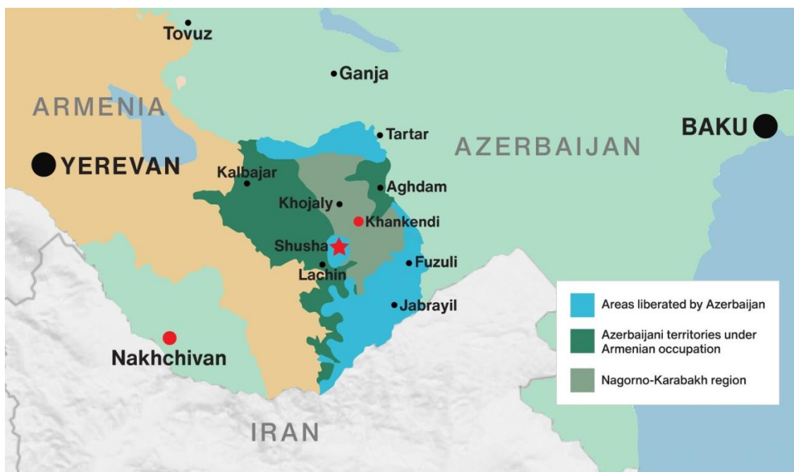
Fig. 5 – Situation in the front on November 8 (Azerbaijan liberates Shusha)

The political and military leadership of Azerbaijan, which predicted the attack of the Armenian Army, in fact carried out a deceptive activity similar to the "Operation Bodyguard". Thus, after the events of Tovuz in July 2020, the Armenian leadership formed the opinion that if the Armenian Army attacks, the Azerbaijani Armed Forces will counterattack in the direction of Aghdam. Thus, while the Armenians expected Azerbaijan to counterattack from the east of Nagorno-Karabakh, the Azerbaijan Army broke through the enemy's defense in the southeast and advanced to a depth of tens of kilometers in a short time (Figure 5).