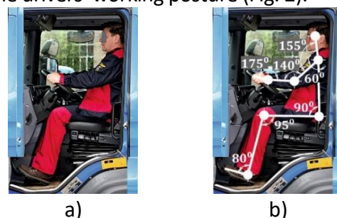
Fig. 2 View of the driver's seat to assess ergonomic factors: a) the location of the driver in the cabin of PB; b) the location of the driver in the cabin of PB with the applied body structure

factor was evaluated based on several photos of the drivers' working posture (Fig. 2).