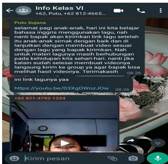
Figure 1. Pre-activity

It can be seen that the implementation of song in teaching speaking can be seen in pre-activity when the teacher related the learning theme to the songs (apperception activity) as well in introducing the material by using song by giving the link for the song. The teacher used everyday life song that students are used to listening in which in teaching greeting, the teacher used song from YouTube.