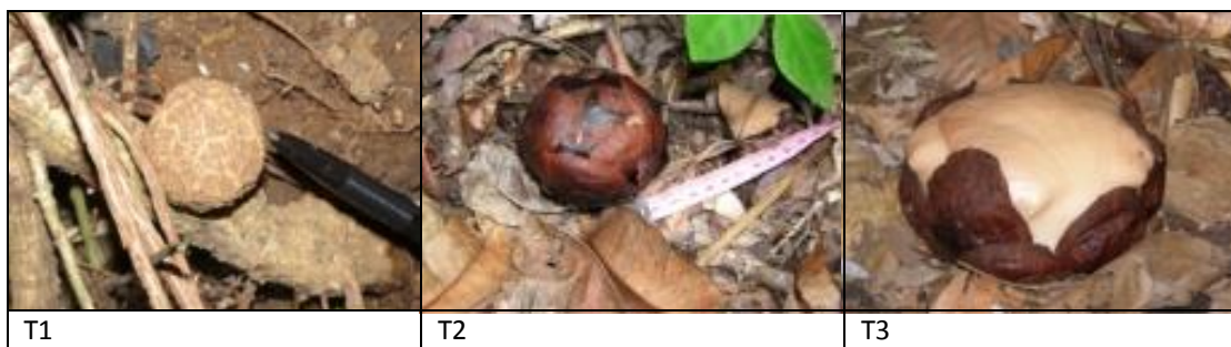
Figure 3. Development of R. patma from bud to the beginning of flower opening during the period of December 2004 and September 2005 at the Pangandaran Nature Reserve.

The Rafflesia seems very sensitive to disturbance caused by the presence of investigators as indicated by many buds failed to grow further and died at different stages of bud development. New buds, mature buds or flowers of R. patma were found at any time of the year, but the natural mortality rate was observed to be very high also. It is implied that a demographic study in their natural habitat could be biased by presence of the researchers.