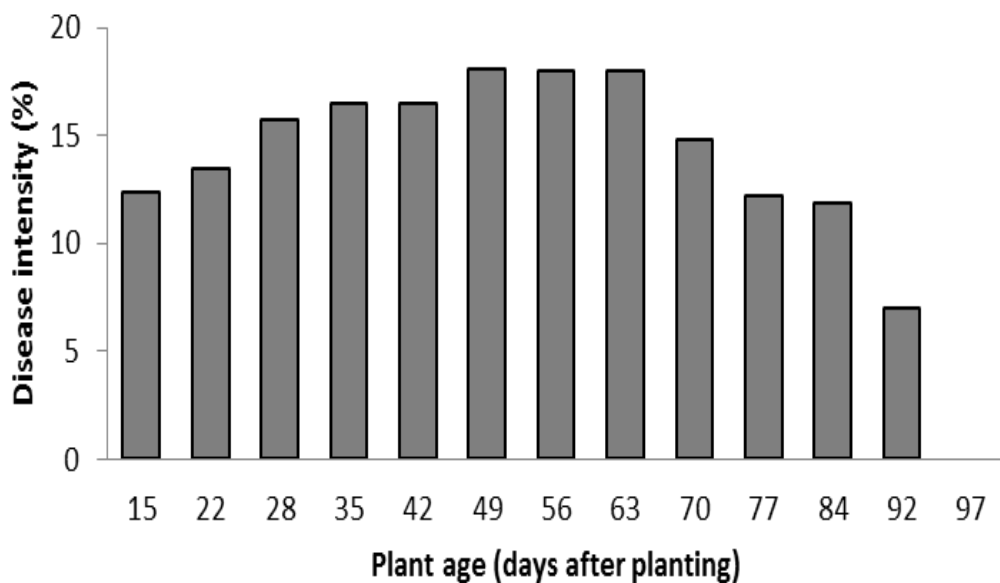
Figure 1. Development of white rust disease intensity on chrysanthemum plants grown under plastic house conditions

During the experiment, the maximum temperature inside the plastic was recorded at 32 °C while minimum at 17 °C and average of 52.7 % humidity especially after 63 days of planting. This unsuitable humidity seemed to be the key factor on the unsuccessful development of white rust during these stages. According to Ortega (1999), Sangeetha & Siddaramaiah (2007) and Barhate, Musmade, & Bahirat (2015), the minimum humidity of 65-90 % was required for the germination of teliospore, though these spores could withstand for more than 7 weeks when exposed to 50 % moisture. While basidiospores according to Gullino & Garibaldi (2007) were more fragile and would die in an hour if the environmental wetness dropped below 90 % or even less than 10 minutes if surrounded with 80 % humidity (Hanudin & Marwoto, 2012). These sub-optimal environment conditions were then, predicted preventing the maximum potential of the spore to release and germinate and contribute to the failure of widespread of the disease.