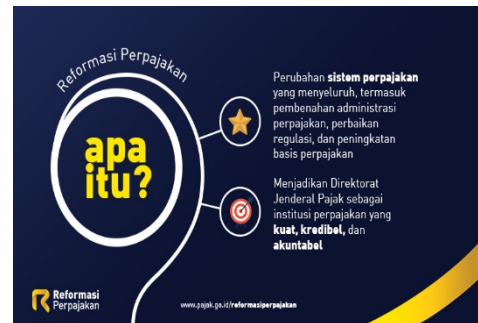
Figure I. Infographics in the Tax Reform Rubric