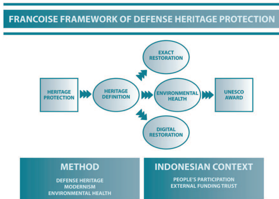
Figure 1: Francoise Framework of Defense Heritage Protection (8).