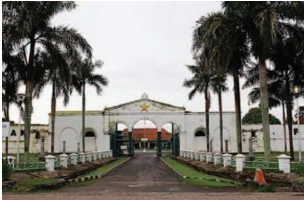
Figure 4: Kuto Besak fort in Palembang South Sumatera (13).

As this paper stated about Revitalization success story in Serbia, Serbian government first of all has political will to do the Research before the Revitalization, so that the Revitalization projects follow the result of Research. It seems Serbian government does not want to do Revitalization carelessly. Besides, based on research of Penica, et al. (12), Revitalization of Villa Zivkovic, as an innovative method of revitalization of the building that has cultural and historical significance. The method applied in this design is based on emphasizing the original aesthetic value of the existing building, and therefore the cultural importance that building carries as one of the representative examples of the development of early Modern in Nis and the surrounding area.