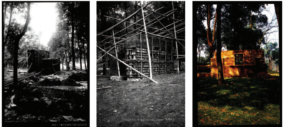
Figure 5: Construction & Experiment Process of Rammed earth wall, West Lake International Sculpture Invitation Exhibition, 2000 [12].

under the leadership of Wang Shu, the amateur architect studio experimented with these kinds of technique. They learned from craftsman, then taught the workers to build the clay tile wall on the construction site [12](Wang, 2002). At the Ningbo Museum, this experiment first became