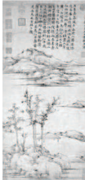
Figure 2: Rong Xi Zhai Painting [10].

it has been an indispensable part of the soul of Chinese cities. He summarizes new feelings and records them every time he walks in the garden. One day, a small garden named Cang Lang Pavilion in Suzhou attracted his eyes. In the garden there was a small single storey building almost completely hidden behind a grove of dense bamboos. “Cui Ling Long” which features three houses conjoined diagonally by their corners. Noticing that people will forget the architecture while moving through the trembling bamboo shadow in the breeze, Wang Shu came up with a complete set of architectural models. In the Spring of 2004, he designed a three storey building with a rectangular plan in one of the five scattered houses. Each floor is three to four meters high, and its section just looks like the plan of “Cui Ling Long”, which twist and turn two times. This small building was named as “Tai Hu Fang” at last. Many years later, while planning the Xiangshan campus for the China Academy of Art, Wang used this experimental model to develop six more variation of this typology and located them in the campus [4](Wang, 2016).