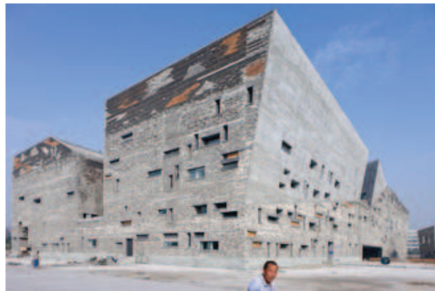
Figure 7: Ningbo History Museum, 2009 [17].