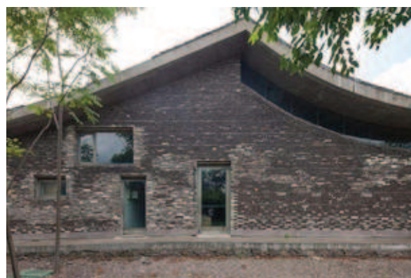
Figure 6: Five Scattered house, the experiment of the tile wall technique, Ningbo, 2004 [14].

accepted in a large, public, government-invested building project. Wang Shu was once accused of insisting on showing backward things in Ningbo by displaying the ancient tile material in the new urban area. Wang Shu retorted that the first function of the museum is to collect time. This building technique will make the Ningbo History Museum project of 2008 the most exquisite museums in collecting time. After the success of the Ningbo History Museum, Wang Shu was commended his keen way of supporting architectural heritage where globalization has stripped cities of their special attributes.