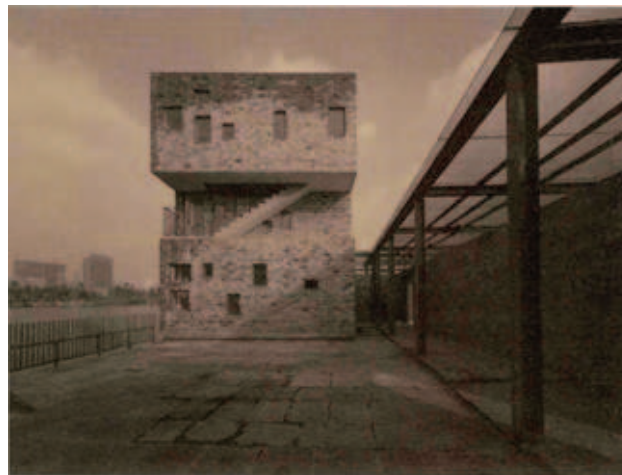
Figure 4: Tai Hu Fang, Ningbo, 2004 [4].

Using this kind of construction method for the first time, he and his colleagues tried many different ratios of clay and earth material. Unfortunately, due to weather changes, the two-wall sculpture collapsed many times.