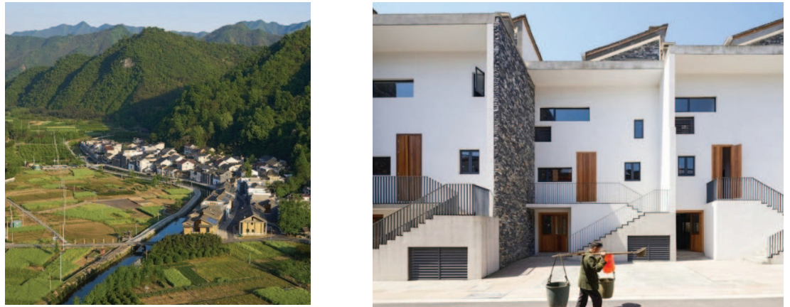
Figure 8: Fuyang, Wen Cun, Fuyang, 2015 [19].