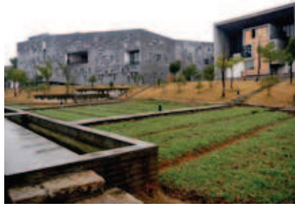
Figure 1: Farmland Inside Xiangshan Campus [8].