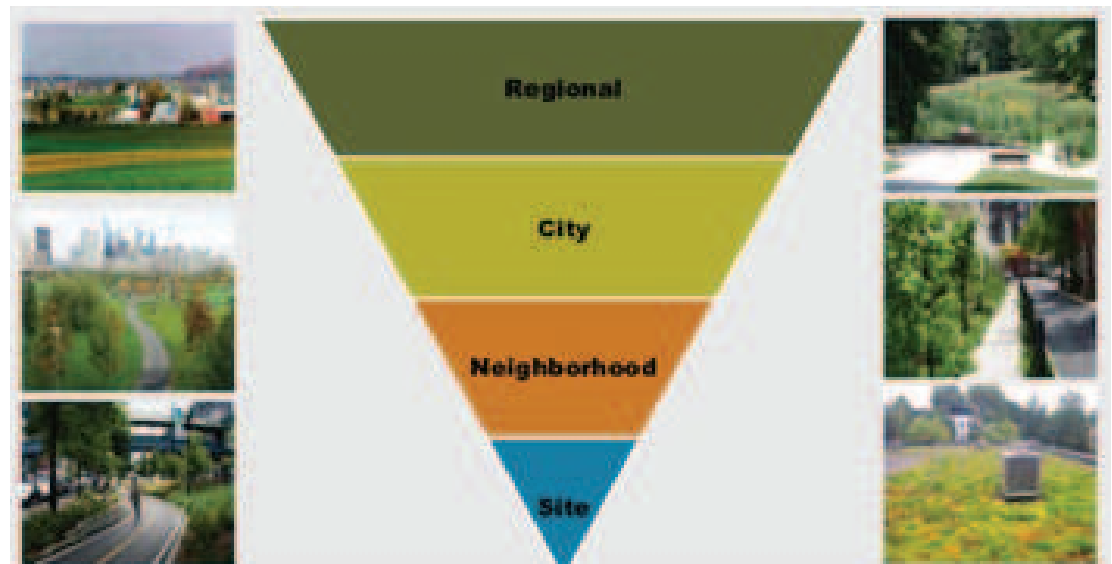
Figure 1: Green Infrastructure at any scales and forms.

and green streets while at site scale it applies to stormwater planters, rain gardens, green roofs and living walls (Figure 1). Generally, GI elements are aimed to maintain natural hydrology functions by absorbing, infiltrating, and storing systems.