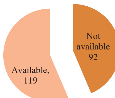
Figure 2: Availability of special lanes for Covid-19 patients.

Participants who indicated that they had a Covid-19 patient transportation protocol at their workplace were 113 people (53.6%) and participants who stated that they had a special route for Covid-19 patients were 119 people (56.4%).