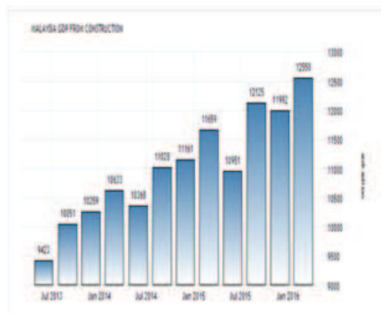
Figure 1: FKDNK construction sector a (Source : Jabatan Statistik Malaysia (2016)).

the construction sector increased to RM12,558 million in the first quarter of 2016 from RM11,992 million in the fourth quarter of 2015 [2]. Looking at this development scenario, it is clear that the construction sector continues to grow rapidly and will contribute to national income. One of the key factors in the development of the construction sector in Malaysia is due to foreign investment and new infrastructure projects that have stimulated development for commercial and residential real estate [3].