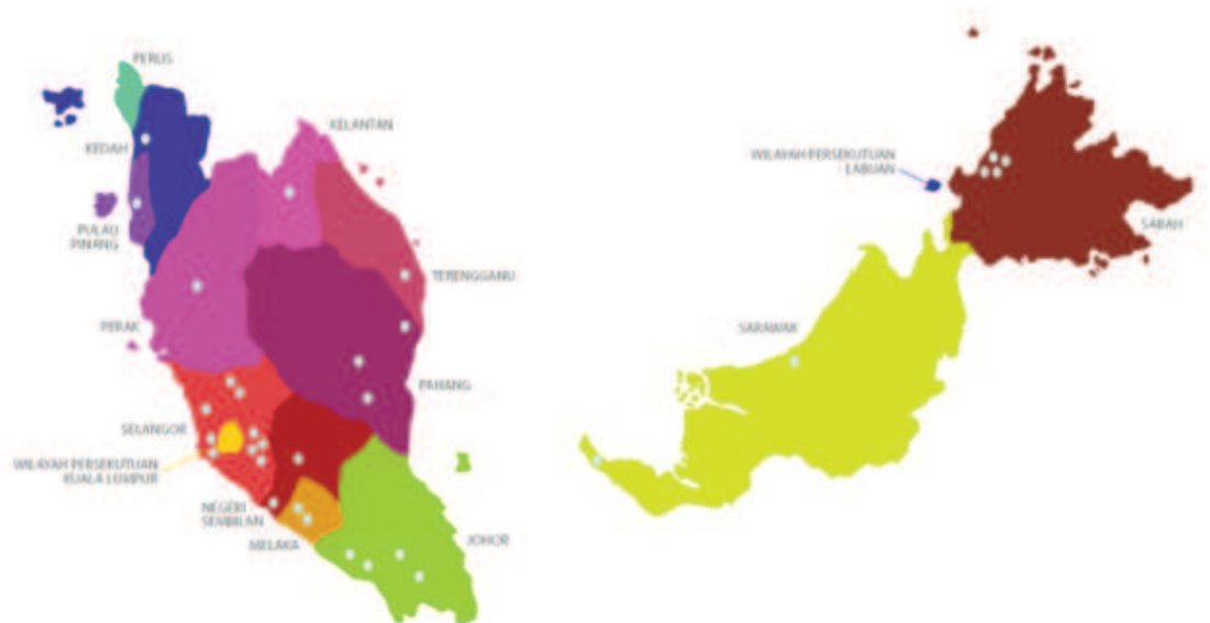
Figure 2: Distribution of block manufacturers in Malaysia, 2016.

This study also uses qualitative methods in the form of interviews. Interviews were conducted against IBS block contractors and conventional brick contractors. All the result from interview and focus group analysed using content analysis. The results of the study were discussed through a focus group method to validate the results of the study so that it could benefit the players in the construction industry. A total of 14 panels comprising academics, engineers, IBS block manufacturers and CIDB officials were involved in this discussion (Table 3).