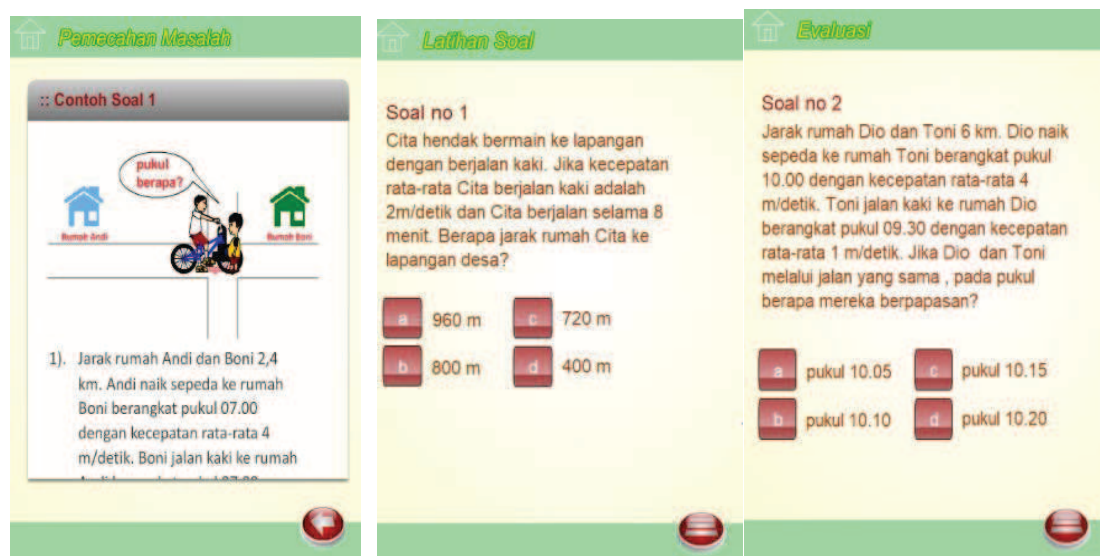
Figure 5: The Evaluation part. It is divided into three parts, the exercise, problem solving, and evaluation.

The scoring from the expert of media and the expert of children psychology upon the media developed is presented in the Table 2.