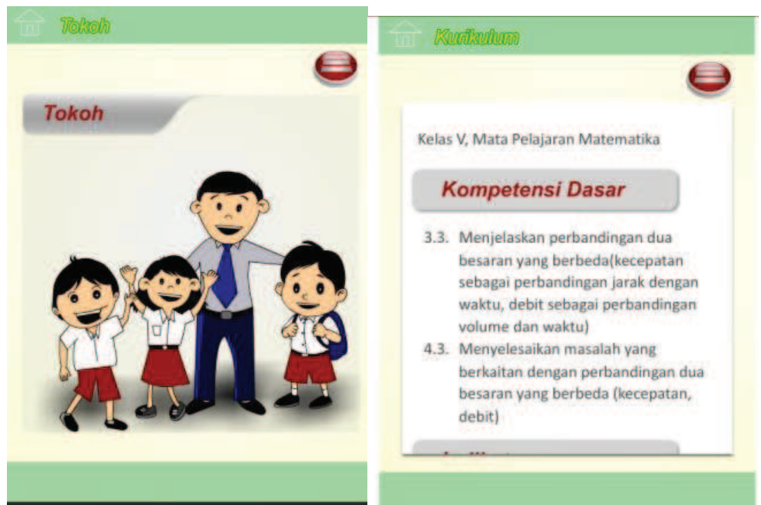
Figure 3: Opening part, the content of curriculum and the introduction of main characters of the story in MLM media.