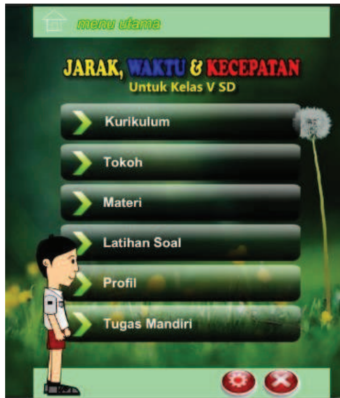
Figure 2: Main Menu.