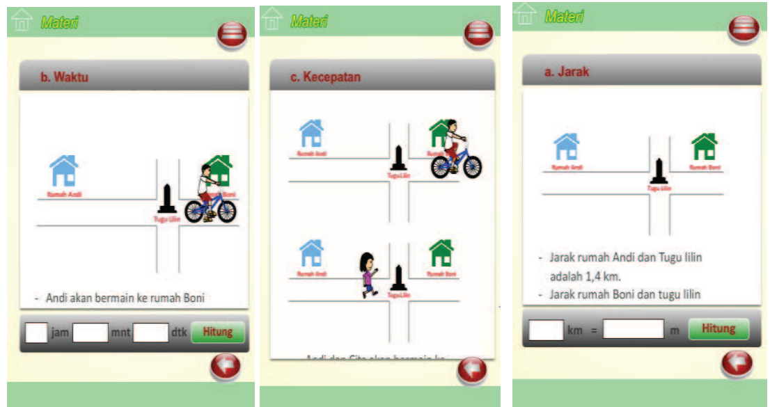
Figure 4: The content part of media, it contains the materials about distance, time and speed.