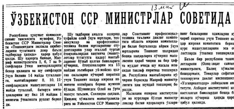
Figure 9. Soviet Uzbekistan newspaper

On the recommendation of the Republican Government Commission, the Council of Ministers of the Uzbek SSR adopted a resolution "On some measures to mitigate the effects of the earthquake in Tashkent." According to the decree, the Ministry of Education was allowed to cancel the entrance exams in grades 5, 6, 7 and 9 and finish the school year on May 14 in these classes. . (Soviet Uzbekistan newspaper, May 13, 1966). Many university students have been actively involved in mitigating the effects of the earthquake (Meza et al., 2017; Maledo & Edhere, 2021).