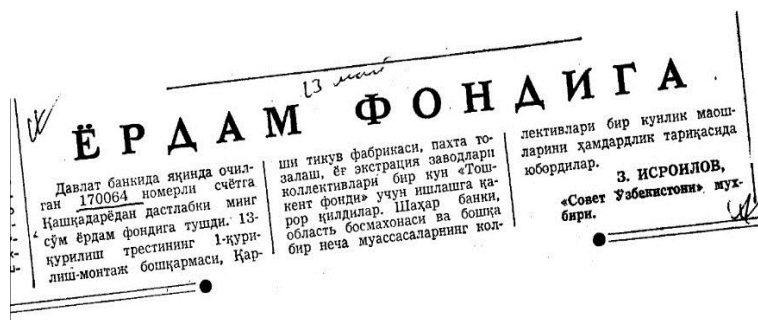
Figure 7. Account number fund for Tashkent earthquake

To eliminate the consequences of the earthquake, the Tashkent Fund was established and its account number was set at 170064.