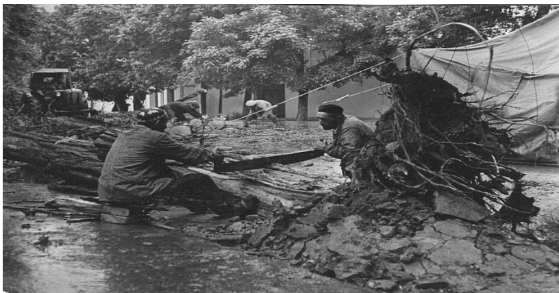
Figure 3. Effect Tashkent earthquake