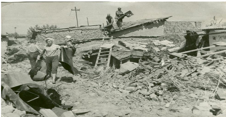
Figure 10. Tashkent earthquake