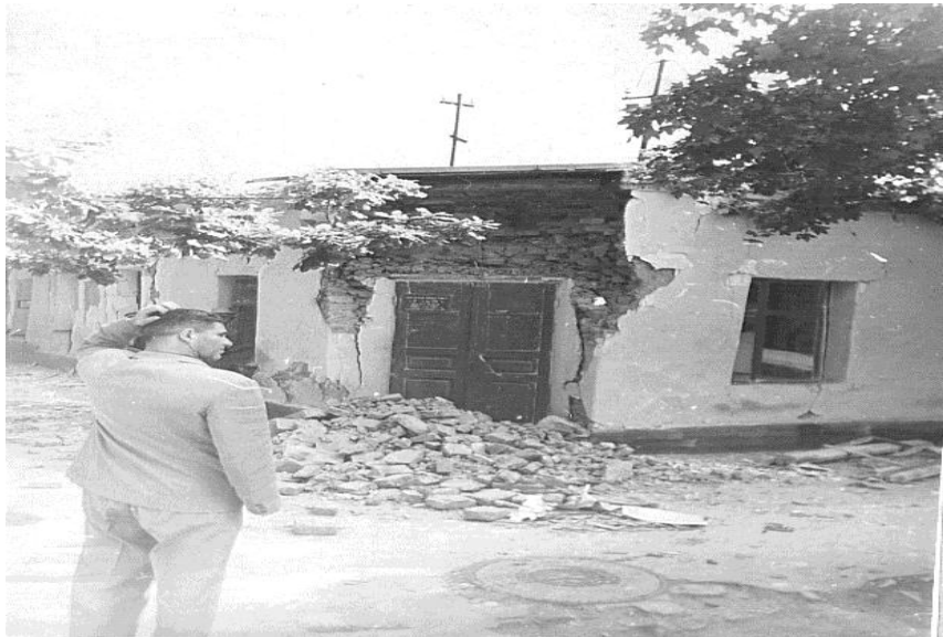
Figure 5. Effect Tashkent earthquake

As a result of the Tashkent earthquake 2 million sq.m. more than 236 administrative buildings, about 700 trade and catering facilities, 26 utilities, about 180 educational institutions, including schools with 8,000 seats, 36 cultural institutions, 185 medical and 245 industrial enterprises were damaged. 78,000 families or 300,000 people from the cities were left homeless ( Tashkent. Encyclopedia. 1992). For comparison, we draw attention to the following data (Rikitake, 1968; Zmazek et al., 2003). One of the smallest sports complexes in Tashkent is Pakhtakor Central Sports and Training Association. If you want to understand it in a broad sense, you will see the favorite football team of the Uzbek people - Pakhtakor. The total area of the sports complex is 72 hectares or 7,200 square meters. If we only imagine the destruction of residential buildings, we will have to embody approximately 280 Pakhtakor Central Sports and Training Associations.