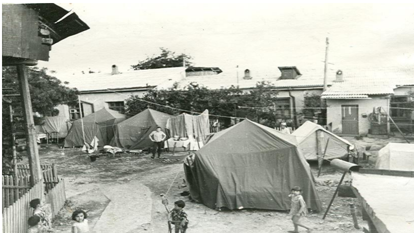
Figure 6. Tents effect Tashkent earthquake

To eliminate the consequences of the earthquake, the Tashkent Fund was established and its account number was set at 170064.