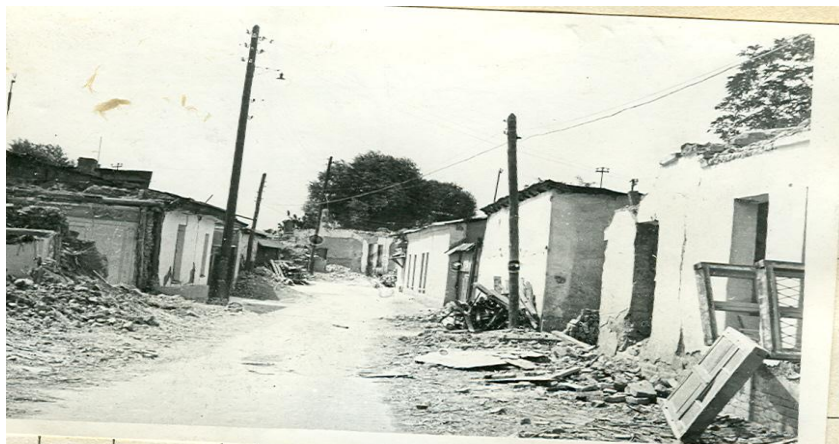
Figure 4. Effect Tashkent earthquake

THE TASHKENT EARTHQUAKE is the longest continuous earthquake in the history of the capital. The number of earthquakes from April 26, 1966 to December 31, 1969 was 1,102. The strongest oscillations, i.e., 7 points and above, occurred on May 9, 1966, May 24, June 5, June 29, July 4, and March 24, 1967. People lived (Tashkentskoe zemletresenie. 1966) in tents in the courtyards of their homes out of depression and fear.