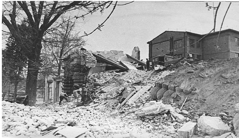
Figure 2. Tashkent earthquake

“Sovet Uzbekistani”, the country's main newspaper at the time, and almost all other media outlets reported that "four people were killed in the earthquake of April 26, 1966, and about 150 were hospitalized" (Soviet Uzbekistan newspaper. 1966). The government of the country will develop measures to immediately eliminate the consequences of the earthquake and set up a government commission responsible for it.