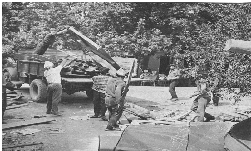
Figure 11. Tashkent earthquake

TASHKENT EARTHQUAKE ... 12 days have passed since April 26. The ground is still shaking. On April 29, at 11:48 a.m., a seismogram tape-recorded an earthquake with a magnitude of 5-6. After that, the magnitude of the earthquake decreased. 178 times more than 2 points, 42 times 2 points, 22 times 3 points, 13 times 4 points and 7 times 4-5 points, a total of 264 earthquakes in 12 days (Soviet Uzbekistan newspaper, May 9, 1966).