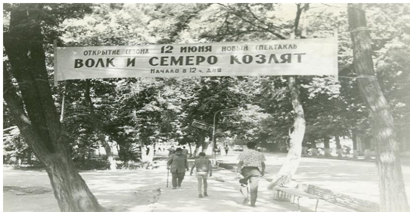
Figure 14. Tashkent looks