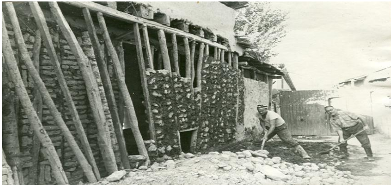
Figure 12. The Uzbek people are naturally hospitable, tolerant, and hardworking

TASHKENT EARTHQUAKE... Nowadays, it is more important than ever to fight against high-level cohesion, stability, peace, iron-clad discipline, and all kinds of rumors and provocative rumors circulating the natural disaster in Tashkent. It is very important to inspire high labor enthusiasm in every production team, to work hard, to take all necessary measures to complete the first tasks of the five years. (Soviet Uzbekistan newspaper, May 15, 1966). Even in the most difficult moments, full opportunities were created for the cultural recreation of the townspeople.