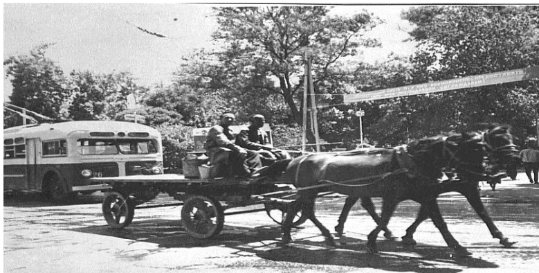
Figure 1. Tashkent looks

Currently, the total area of Tashkent is about 334.8 square kilometers or 33.8 thousand hectares, and the population is 2.3 million around. In 1939, it was the eighth largest city in the former Soviet Union, and by the 1970s, it was the fourth largest (Tashkent. Encyclopedia. 1992.) city in terms of land area and population, after Moscow, Leningrad (now St. Petersburg), and Kiev. In order for our readers to get a clear picture of Tashkent, the two most popular German cities are Cologne (area of about 405.15 km 2 , population 986,168 thousand people) and Munich (area of about 300.00 km 2 , the population of one million three hundred thousand people). Around). To date, Tashkent consists of eleven administrative districts. These are Bektemir, Mirzo Ulugbek, Mirabad, Sergeli, Sabir Rakhimov, Uchtepa, Hamza, Chilanazar, Shayhantahur, Yunusabad, Yakkasaray districts, where a total of 474 mahalla and quarter committees, local self-government bodies operate. Here is some information for comparison. At the beginning of the 19 th century, the city consisted of four districts: Shayhantahur, Sezbor, Kokcha and Beshyogoch. The city area at that time was only 16 km 2 and had a population of 80,000 (some sources say around 100,000).