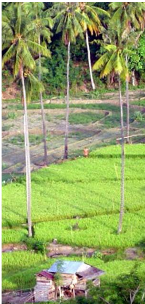
Tabel 6.1 Luas Panen dan Produksi Padi dan Tanaman Pangan Table Harvested Area and Production of Paddy and Food Crops, 2005 - 2007