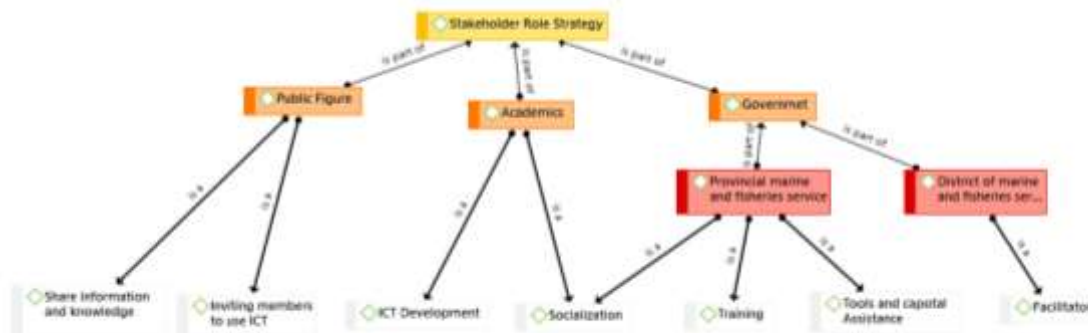
Figure 2. Stakeholder Role Strategy in Utilizing the Use of Information and Communication Technology in the fishing community

The government, in this case, the Provincial Marine and Fisheries Service and the Regency Fisheries and Marine Service have different roles because their duties, functions, and authorities are also different. The District Marine and Fisheries Service just as a facilitator from fishermen to higher government and vice versa. In addition, the Provincial Marine and Fisheries Service assists fishermen in resolving conflicts between fishermen, who go fishing in zone 1. Meanwhile, the Provincial Marine and Fisheries Service has a bigger role than the district service, such as providing socialization, training, and assistance in the form of tools and capital. This is as conveyed by the Department of Maritime Affairs and Fisheries of Pati Regency during an interview as follows: