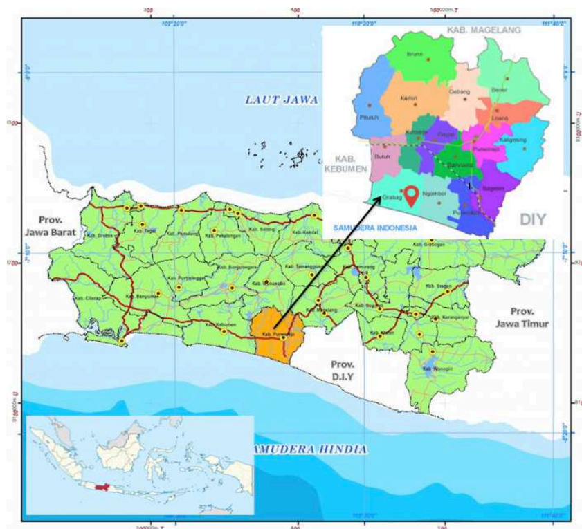
Figure 1. Site location

The research was conducted from 2016 to 2019 in Patutrejo Village (7°50'46.1"S, 109°53'55.4"E), Purworejo Regency, Central Java (Figure 1). The research location was in a coastal area within ± 500 m of coastlines. The site soil was checked at the Jenderal Soedirman