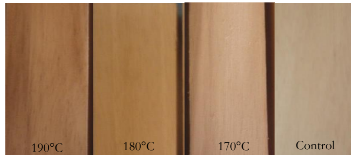
Figure 2. Surface performance of control and densified JUN wood at 170°C, 180°C, and 190°C compression temperatures

Gambar 2. Performa permukaan kayu JUN kontrol dan dipadatkan pada suhu kempa 170°C, 180°C, and 190°C