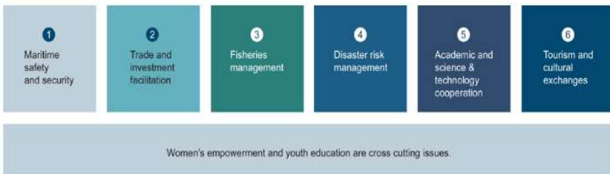
Figure 3. Six Priority Areas of IORA