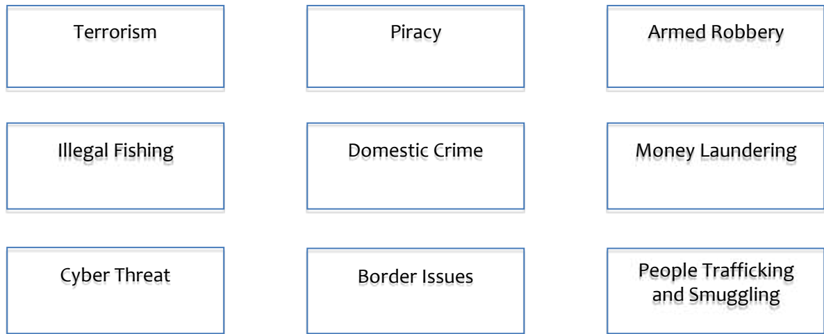
Figure 4. Domestic Issues on Security