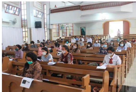
Figure 4. Participants (Principals and Teachers) in the seminar of Education