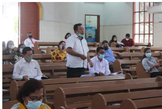
Figure 5. Question and Answer (Q&A) session to the presenter