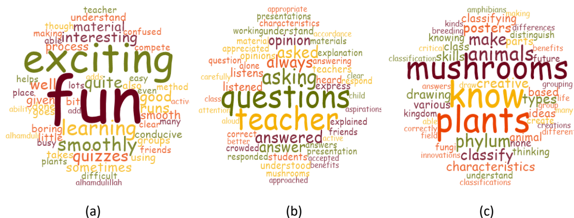
Figure 2. (a) Student’s learning process, (b) Student’s learning value, (c) Student’s skills

Table 2. equation can explain that a constant of 110.525 means that the consistent value of the entrepreneurial skills variable is 110.525. The X regression coefficient of 0.577 explains that every 1% increase in the value of creative thinking infusion, then the value of entrepreneurial skills increases by 0.577. The regression coefficient is positive (positive number), it can be concluded that the direction of the influence of the creative thinking infusion variable on entrepreneurial skills is positive. Decision making simple regression test based on the significance value of the coefficient table obtained a significance value of 0.557 > 0.05 so it can be concluded that the creative thinking infusion learning framework variable has no effect on student’s entrepreneurial skills. Based on the t value, it is known that the t_{count} value is 0.594 < t_{table} 2.040 so it can be concluded that the creative thinking infusion learning framework variable has no effect on the entrepreneurial skills variable. So that the hypothesis which says there is an effect of creative thinking infusion learning framework on student’s entrepreneurial skills is rejected.