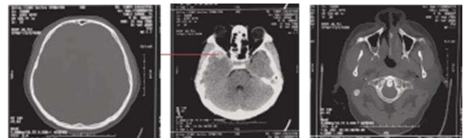
Figure 2. Head CT Scan

Laboratory finding of hematology have abnormal of Hematokrit 39.9 (Normal 41.5-50.4) and white blood count 22.80 (4.40-11.30) and other parameter is normal. Thorax x-ray, cervical x ray and pelvic x-ray showing normal radiographic picture. Head Ct Scan showing soft tissue at right temporal region, hyperdense mass biconvex at right temporal region an hematosinus at right maxillary sinus region. 3D head ct scan showing discontinuity of left orbital rim bone. USG FAST showing no sign fluid collection in hepatorenal, splenorenal, and vesical urinaria space.