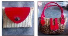
Figure 6. New product design

The increasing diversity of product design results from product design training is 2 new product designs. Prior to marketing, the new product is made prototype and experiences the market tested so that partners know the interest and quality of the product.