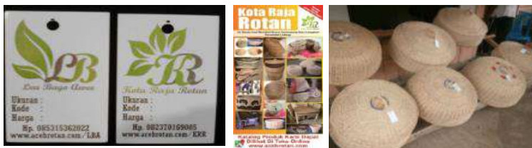
Figure 7. The product already has a hangtag and a brochure