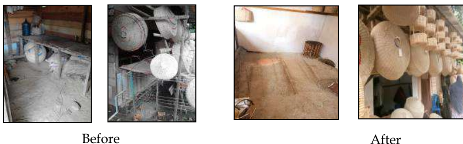
Figure 11. Result of showroom space renovation