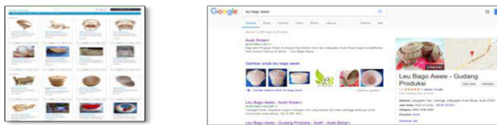
Figure 8. Online store website