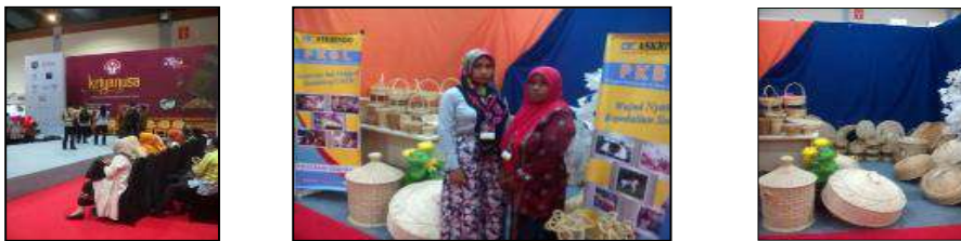
Figure 9. Chairman of SME Kota Raja Rotan at Exhibition