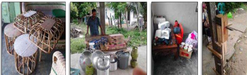
Figure 5. Production tools