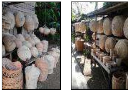
Figure 2. Some products of SME "Kotaraja Rotan"

The products involve serving covers, baskets of clothing and others made from rattan in the form of craft for household and other needs. These products can be described as follows.