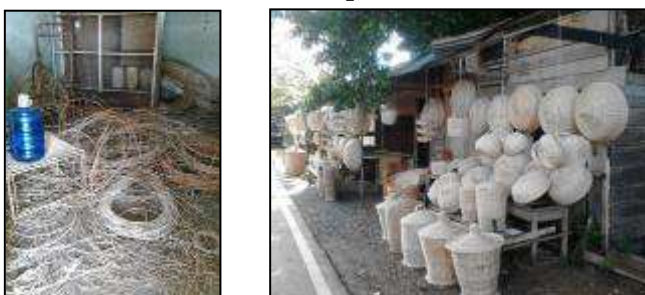
Figure 3. Raw Materials Room and Showroom

Storage place in the form of raw materials is done in place of production while finished goods are placed in the showroom area and the spaces around the place of production. It causes unkempt and uncomfortable. Based on the survey, the condition of the storage area, whether the raw materials or finished goods has not been arranged and still needs to be increased capacity and quality of equipment. The storage of finished products is still mixed with the office and the storage of raw materials is still found mixed with the production activities.