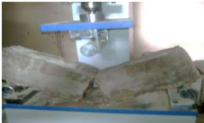
Fig. 1 - Flexural Test Setup