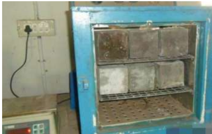
Fig. 2 – Water Absorption test