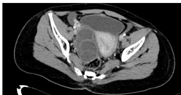
Figure 2: CT picture shows bilateral theca lutein cysts

CT findings (9.7.2020) were consistent with bilateral theca lutein cysts: Bilateral ovaries have multiple large cysts within –right ovary 7.4x5.5x3.7 and left ovary 5.9x9.4x5.7 without enhancing solid lesions. (Fig 2). No enlarged lymphnodes and there was minimal ascites in pelvis. Thyroid gland appeared normal in size with mild heterogenous enhancement. Endocrinologist opinion was obtained and a final diagnosis of Hashimoto's thyroiditis was confirmed. FNAC of thyroid was deferred.