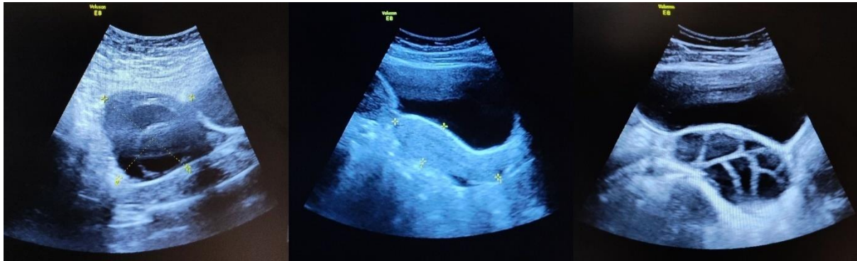
Figure 1: shows normal uterus in the centre and enlarged cystic ovaries on either side

present in both ovarian pedicles. Uterus measured 8.7 x 3.2 cms and endometrial thickness was 10 mm. Liver, Gall bladder and both kidneys were normal. A provisional clinical diagnosis of bilateral theca lutein cysts was made. After the scan findings, history of recent pregnancy was elicited which the patient and her mother denied. Hormonal profile including TFT was advised.