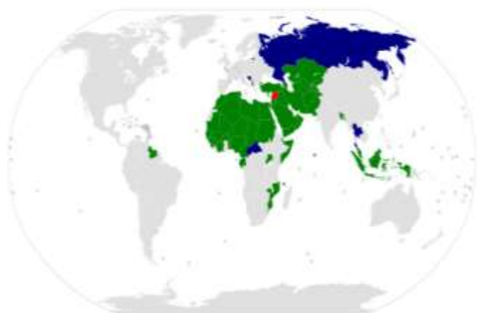
Рис. 3. Member states (green) and observers (blue) of the Organization of Islamic Cooperation. Syrian membership temporarily suspended (red)

essence of Islamic finance products, the demand for such products has also increased. The main thing was that in these countries there was a huge amount of free funds (resources).