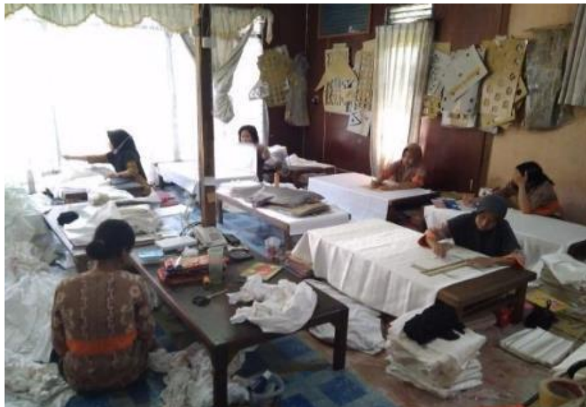
Figure 3. The activity of artisan drawing Sasirangan fabric patterns