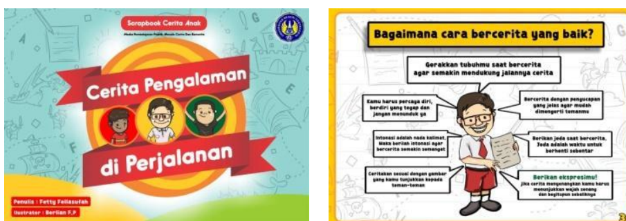
Figure 2. Design scrapbook of child stories

The scrapbook of child stories contains Indonesian language teaching materials especially story writing and storytelling materials for grade II students of elementary school. The scrapbook of child stories referred to the teaching objectives, Curriculum 2013, standard of competence, core competence, basic competence, indicators of learning, and teaching materials. The innovation developed by adjusting the components and learning objectives. Arranging the content according with the objectives will have a good effect [22]. The scrapbook of child stories consists of several parts, including the introductory part, content part, final part, and closing part. Consist of the scrapbook based on the literature study conducted. Scrapbook child stories a media for learning storytelling referring to concept of innovation, functioning of the innovation, its benefits, and its meaning [23]. The learning materials are presented with illustration and pictures interesting to creating learning activity enthusiastic for students. The Figure 2 are the cover design and material contained on scrapbook of child stories. The title used is an adjustment to the learning theme and goal as well as the material presented. In the Figure 3, there are some pictures of learning activities carried out using scrapbook of child stories.