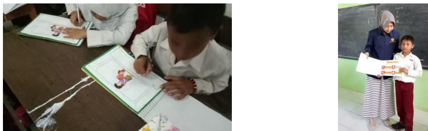
Figure 3. Learning activities with scrapbook of child stories

The data obtained in this study were the results of the storytelling skills test aimed at grade II students. The test is carried out in two stages, namely pretest and posttest. Pretest is given to students before students get treatment, while posttest is given after students carry out the learning using scrapbooks of child stories media. The research data was taken to determine the differences in the control class and the experimental class. The control class is a class that follows learning without using scrapbook of child stories media, while the experimental class is a class that takes part in learning activities using scrapbook of child stories media. Table 1 displays the descriptive statistics of the control class and experimental class at the pretest stage.