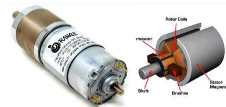
Figure : DC motor

There are different types of controllers like lead, lag, LQR, PI, and sliding-mode control that are used in control applications. Among the few mentioned types of controllers, PI controller is one of the earliest and best understood controllers which is incorporated in almost every industrial control application due to its