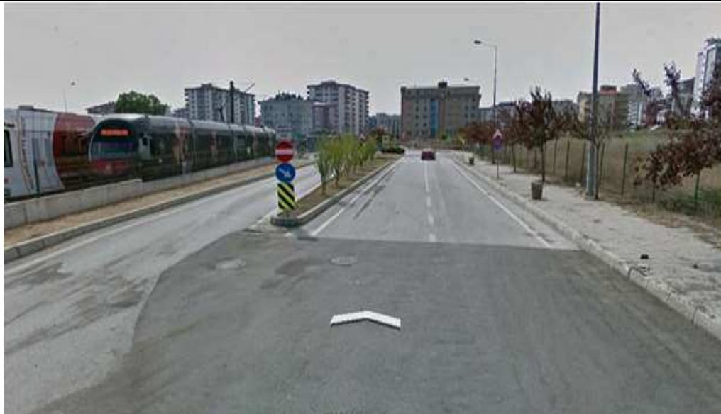
Figure 4. Street View