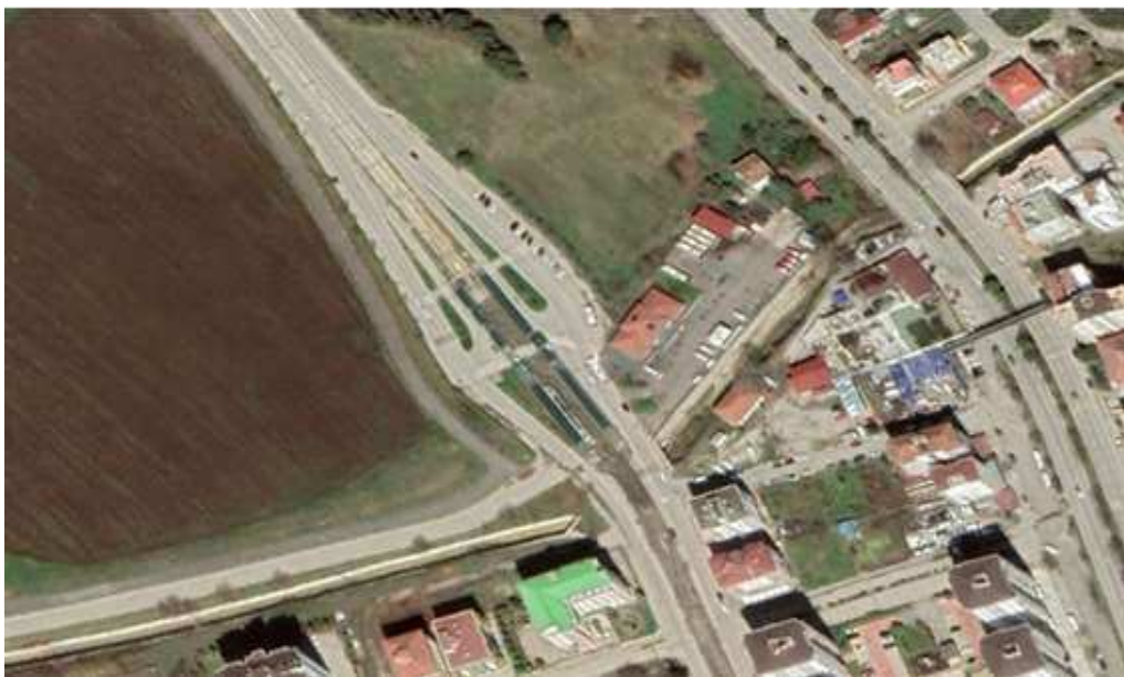
Figure 1. Before the Railway Extension is completed (2017)

In the west and east of the OMU RECTORATE stop on İsmet İnönü Boulevard in the Atakum district of Samsun province, there were bus ring stops created when the business was first opened. These ring buses were carrying passengers since there was no railway between OMU RECTORATE and OMU HOSTEL'S. Later, when the railway line construction was completed in this section in 2017, the passenger transportation of the ring buses in this section was canceled. As a result, these ring bus stops have become dysfunctional. The section with the bus stop in the west of this area was combined with the highway and the curved part of the road was arranged with this study.