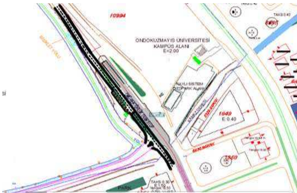
Figure 5. Project Work

In addition, a 2.50 m wide parking pocket is reserved. The reason for the separation of the parking pocket is that in modern transportation cities, PARK AND RIDE points and bicycles and road vehicles are parked at the tram stop and the transportation of people continues with public transportation modes. Thus, a parking pocket was created in this project work. In addition, it has been ensured that the asphalt surface of approximately 950 m 2 remaining from the curve and the bus stop can be transformed into a green area.