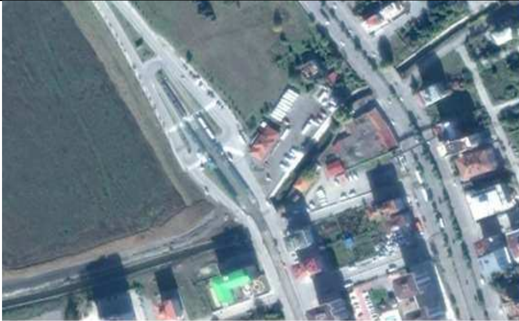
Figure 2. After the Railway System is completed (2021)

In this section, with the completion of the railway line, the ring buses were canceled and the bus stop pockets in this area became dysfunctional. In this part, with the presence of the curve on the highway, the braking distances of the vehicles are extended, the brake linings of the highway vehicles are deformed early, more fuel consumption occurs and the road traffic delay times increase. At the same time, traffic safety is more risky due to the fact that the highway is curved.