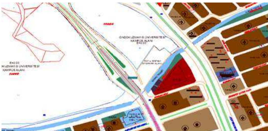
Figure 3. Current Map View

First, detailed investigations and observations were made on the highway. Then, the location was determined on the existing map file of the area. Later, road geometry was arranged in highway standards and the traffic safety of the road was made more convenient. Pedestrian crossings have been arranged. In addition, a park and ride point, that is, a parking pocket, has been created near the tram stop for road vehicles.