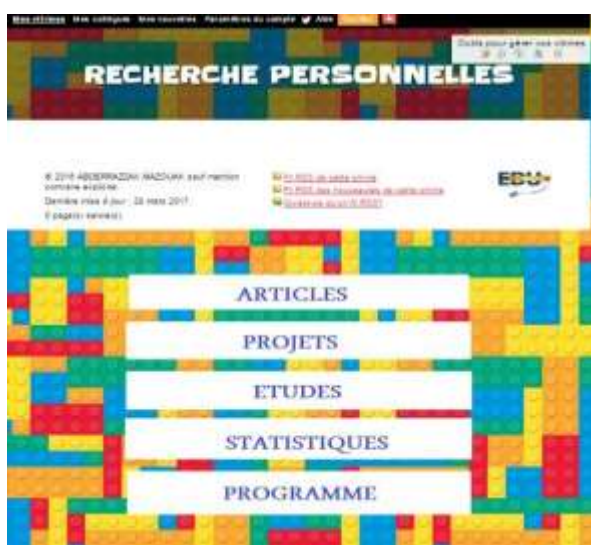
Figure. 3: The Personal Research Showcase