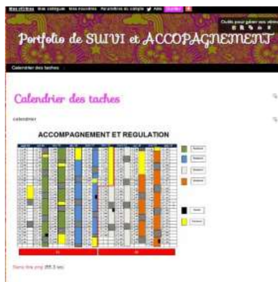
Figure. 4: The Personal Program Showcase