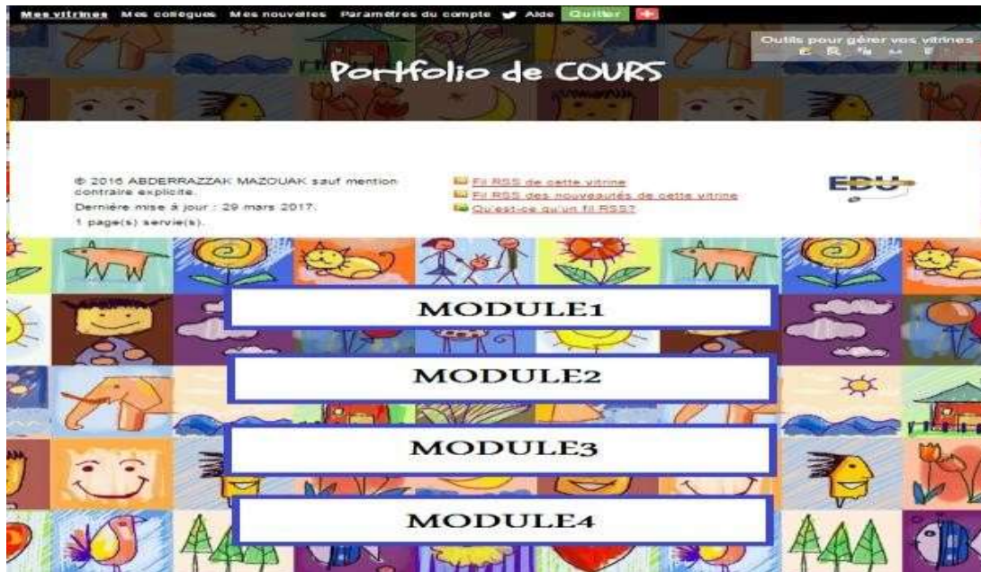
Figure. 1: E-Portfolio Home Page

(presentation portfolio) addressed to his peers or to employers. And adds a trainee's progression (learning portfolio)...,, Depending on the nature of our training within the regional center by alternation with weeks of training and weeks of internship, also the trainees are called to present an end of studies project at the end of the training. Our device takes its support from the hybrid model which is characterized by completeness and variety and specificity, and offers possibilities of evaluating hot and cold by referring to secure and modifiable passwords. figure 1)