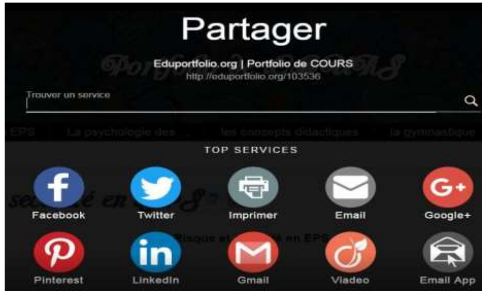
Figure. 5: the showcase of sharing icons

The use of the e-portfolio is possible for all teachers of all subjects and also other stakeholders in the field of education who want to develop their strategic organizational, communication and technological skills.