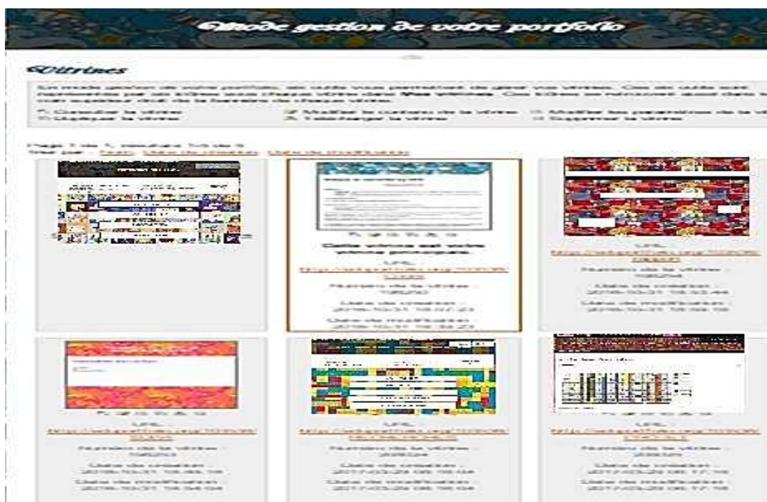
Figure. 2: The Course Showcases the E-Portfolio Engineering Stage