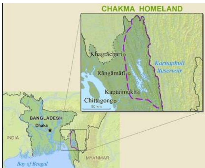
Fig-1: Geographical location of Chakma community

Mainly observation methods have been used to explain the process of Chakma cloth making. In discussing the influence of culture and tradition on the tribe's clothing some previously published research articles have been consulted, the views of some prominent researchers working with tribal culture have been taken by interviewing with open-ended questionnaire and some of the tribal leaders were also interviewed. The researcher interviewed reputed fashion designer of Chakma community, conducted Group Discussion with weaver and observed weavers' weaving work.