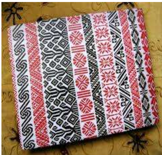
Fig- 7: Chakma motif