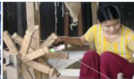
Figure- 3: The Charka