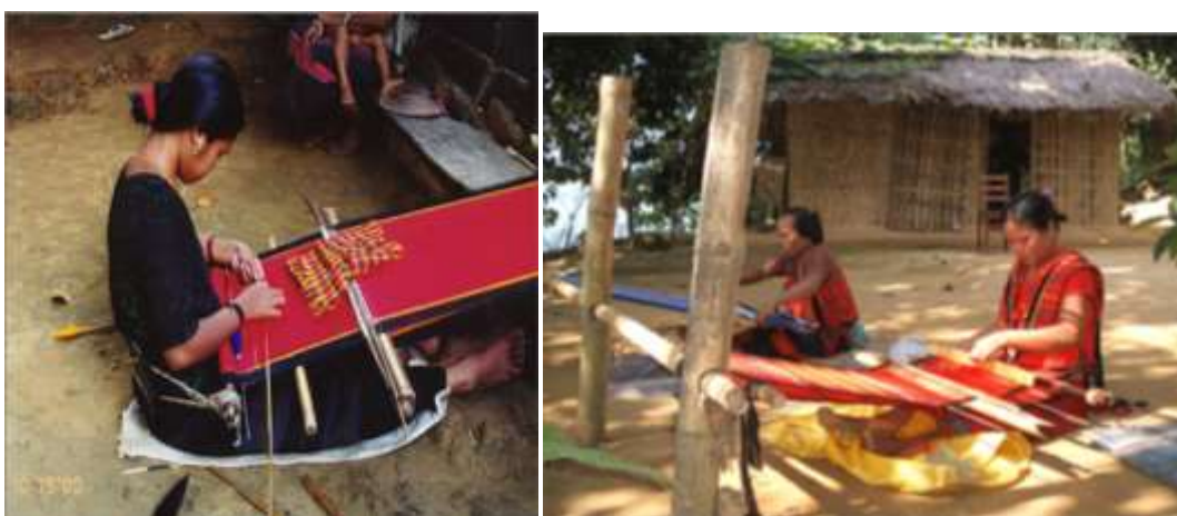
Fig- 6: Weaving

Mainly Chakma women play the role of weaving cloths by their back- strap loom at the courtyard of the house. Once the yarn has been fastened to the loom, the weaver sits down, her legs straight in front against the bainugor, foot rest. She fixes the back strap behind her waist. In order to weave, the weaver moves the warp threads up or down with the help of the ajaju, creating a space called the shed. The biyong is placed in the shed vertically. The weaver then passes the shuttle, known as thurchuma, through the shed. Then she uses the flat edge of the biyong to beat the weft thread against the woven cloth. The biyong is taken out and the suchok bash is used to reverse the threads of the warp. With the help of the ajaju, a fresh shed is created between the threads which have become reversed. The biyong is replaced in the shed vertically and the shuttle passed from left to right. When the weaving begins, the split tagalong bash works as the first weft. The process continues in this way for plain weaving.