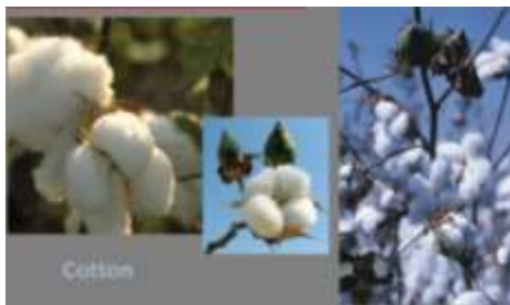
Figure – 2: Cotton

Traditionally, they use cotton and produced that in the hilly slopes from jum (slash and burn) cultivation for making the yarn for weaving. The cotton would be removed from the pod and brought into the house and thoroughly cleaned. It was then spread out on mats and left to dry in the sun for two or three days. The dry cotton was then ginned to remove the seeds and to make it soft. Afterward it was rolled by hand on to little pieces of bamboo. It was further refined by being rolled on a rod called pech, before being spun into yarn with the charka or spinning wheel. Though these days, most yarn is purchased from the market. However, on the occasion of Kathin Chibar Dan, cotton is still picked in the traditional way and spun into yarn before being woven into cloth. All this takes place within 24 hours, with groups of women working around the cloth.