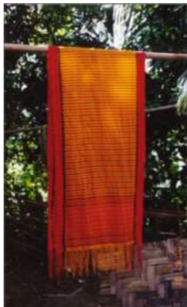
Fig- 8: Hadi