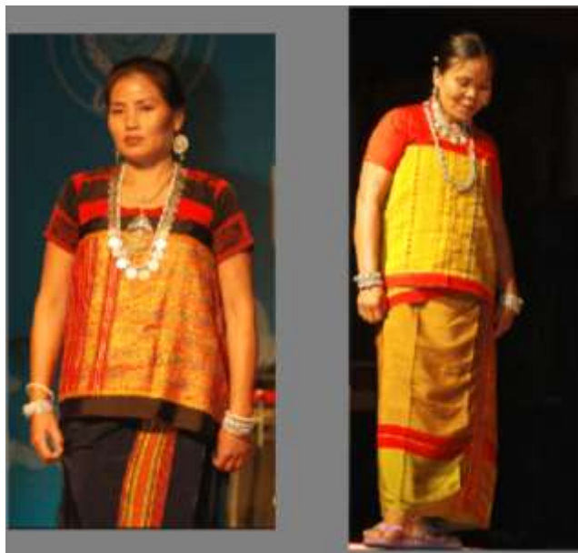
Fig- 9: Chakma women in traditional dress

Moreover, they also wear the siloom, a loose, stitched upper garment, was generally worn when they went to the forest for jum cultivation or to collect twigs. The khabang is a long piece of cloth worn around the head. With the increasing number of Bengali inhabitants in the Chittagong Hill Tracts area, Chakma women began feeling uncomfortable with their usual outfits in public places. Therefore, these days to counteract the gaze of the outsider, in urban areas they started adding an upper garment to their traditional wear, a blouse. This is worn with a variety of necklaces, bracelets, anklets, rings, and other ornaments. Jewellery used by the Chakma women include various ornaments made of coins, metals and local available flowers. Nowadays in urban areas, instead of traditional cloths Chakma men usually wear western-style shirts and trousers but in rural areas many continue to wear knee – length dhuti or lungis (sarongs).