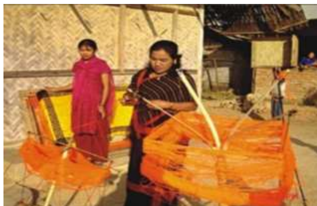
Fig-4: Yarn Processing

Though these days most of the yarn is purchased from the market but those yarns still needs further treatment to prepare for weaving. The skeins are starched and hung out to dry. After the skeins are dry, they are wound round bamboo frames known as natai or nadai and wound into balls known as thum. When industrial yarn is purchased in spools, it is made into skeins with the help of lanyya. These skeins are then dyed, starched and made into thum.