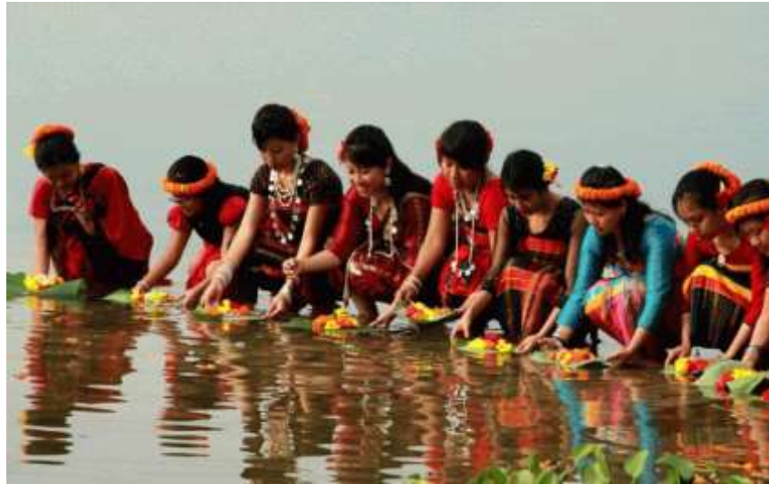
Fig 11: Clothing in Bizu Festival

Kothin Chibor dan is another main religious festival of Chakma community. On that festival day people respect Buddhist monk through offering chibor (means cloth) gift. Women make that chibor on a very traditional way. They collect gin jum cotton, spin the cotton into yarn, collect natural dye, dye yarn, dry the yarn, weave into cloth and sew the cloth into ceremonial dress and present that chibor (ceremonial cloth) to monk. After receiving that robe (chibor) monks left their old robe and wear new robe.