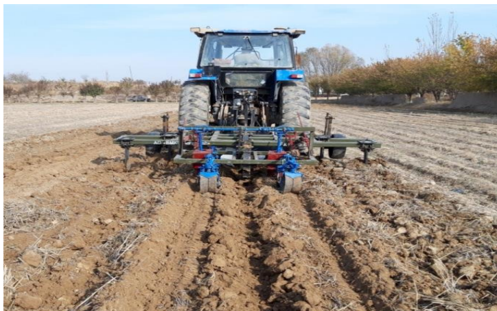
Figure 3. A view of the working process of a combined machine in a field emptied of wheat

seeds of melons in two rows at the top of the ditch, with 60, 70 or 90 cm between the main rows.