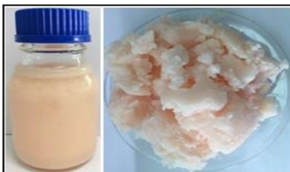
Fig.2: RICE BRAN GEL