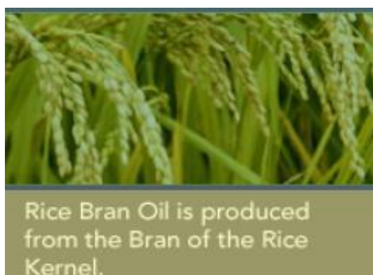
Fig1: RICE CROP

The literature studies reveal that a lot portion of the work has been done in the topic cosmetics. During the very first attempts, waxes like carnauba waxes were blended to yield skin care products. Later, utilization of petroleum fractions used for the production of cosmetic products had become the trend. But now technologists are again trying to switch towards the natural raw materials. With the same objective, this paper highlights the utilization of Rice Bran Wax as a basic raw material for cosmetic preparations. Distinct formulations were prepared and were tested for their pH value, moisture content, percent solids, surface tension, and viscosity.