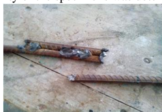
a) Failure of Welded Splice

There are three basic ways to splice the bars i.e. Lap Splice, Welded Splice and Mechanical Splice. For comparison purpose an incremental tensile load tests were carried out on welded splices as shown in Figure 4 (a) and coupler splices and or mechanical splice as shown in Figure 4 (b). The results were analyzed as shown in Table 2 and the feasibility of the specimens was determined based on several evaluation criteria.