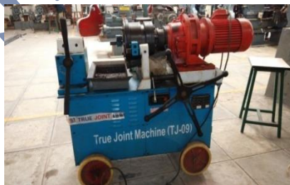
Figure 2: True joint (TJ-09) machine