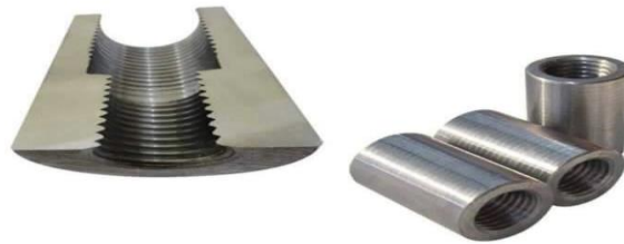
Figure 1: Typical threaded splice system

A common older interlock system is the threaded coupler as shown in Figure 1. With an ordinary system of threading, it is common to dress the ends of the rebar before cutting or rolling the threads, thereby reducing nominal bar area and lowering load capacity. There is little or no strength difference between cut and rolled threads of the same size. Rebar ends may generally be threaded either in the fabricator's shop or in the field. Threaded bar ends must be protected against damage during shipping and handling until the splices are completed.