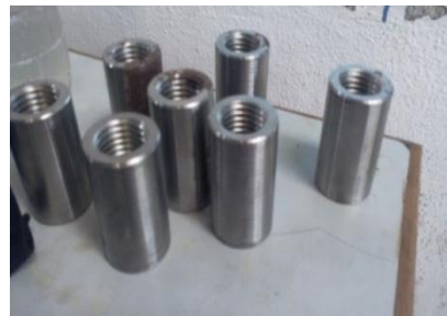
Figure 3: Mechanical Threaded Couplers