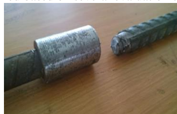
b) Failure of Coupler Splice