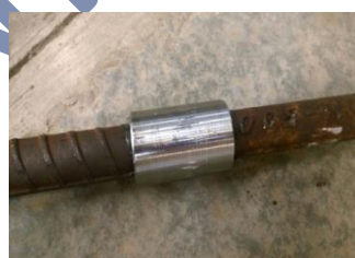
b) Coupler Splice