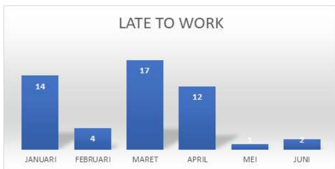
Figure 1. Timeliness Data Source; PT. SAI (2021)

Based on Figure 1, it can be seen that the problems that occur in morale affect employees, seen from the data on delays in the warehouse employees of PT. S AI, totaling 44 people, employees who were late for work in 2021 in January 14 times a month, in February 4 times, in March 17 times, in April 12 employees were late, in May 1 time and in June 2 times. The level of delay is something that needs to be paid attention to, because it is related that work morale affects performance. From these data, it shows that the problem of the level of morale is still low that occurs at PT S AI so that it makes employees lazy to come to the company and results in work not as expected. Morale must be increased at work, because if morale is not increased it will result in a high number of absenteeism in employees which affects the decline in targets set by the company, because work discipline is one of the keys to achieving the company's success in realizing its goals. Work discipline will encourage employee performance within the company, because the company continues to develop and progress, there must be employees who have high discipline. Therefore, work discipline and employee performance are two things that are always related and related. Based on the attendance data at PT. S AI still has employees who are often absent from work.