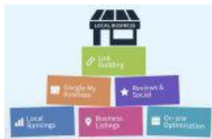
Figure 1. Local Business [1].

Every small company or multi location company can increase their business and attract more customers using the Local SEO strategy. Local SEO (Local Search Engine Optimization), which is often referred to as Local Search Engine Marketing is a very effective way to market a local business online, as it helps businesses promote their products and services to local customers right when they are looking for products and services. it's online [1].