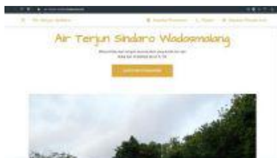
Figure 3. Website Curug Sindaro

In this research, the resulting website for Curug Sindaro, search results on Google Search and Google Maps have used Local SEO. By using Google My Business as a medium for promotion, make your business well managed through existing features.