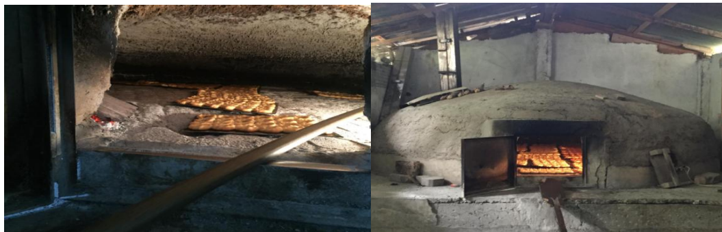
Figure 4. Internal view of the adobe clay oven

Figure 4 shows the interior part of the adobe oven and figure 5 shows the products made in the traditional oven bakery.