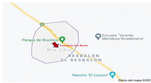
Figure 1. Location of the San Martín bakery

In figure 1, the place of the investigation can be located, which was carried out in the Resbalón, as it is observed in the Río Chico community.