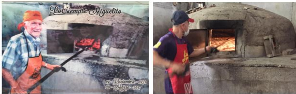
Figure 3. The then and now of the adobe clay oven