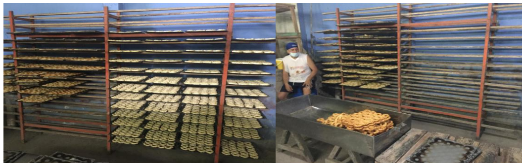
Figure 5. Products made in the traditional clay oven bakery

The interior of the ancestral clay oven can be seen in the images, and the traditional salt threads are placed on the tin base, which constitutes a typical element of peasant food extended to urbanity.