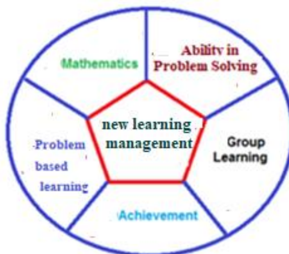
Figure 2. Components of a developed learning management model

The results of research concluded that the new learning management model as shown in Figure 2.