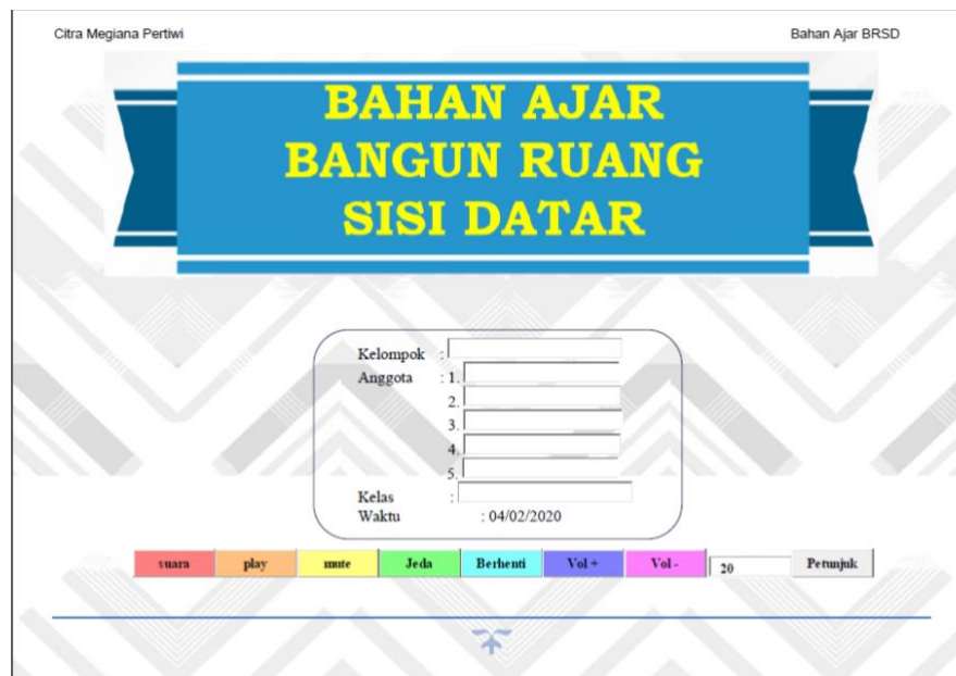
Figure 4. Display a cover of teaching material

Figure 5 is a sample of teaching material content based on VBA Microsoft Word where there are conceptual findings on the volume and surface area of the cube. In addition, teaching materials contains material from recognizing prisms and pyramids, making characteristics and definitions of prisms and pyramids, distinguishing the sizes of cubes and blocks, proving the volume of cubes and blocks, comparing the volume of prisms and pyramids, finding the formula for the surface area of prisms and pyramids, until as in Figure 6, it is an evaluation tool that contains MPSA questions with different level of pain indexes.