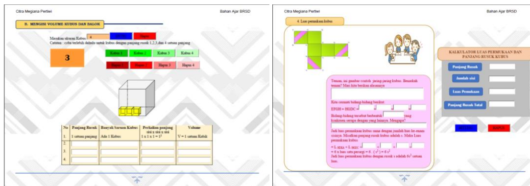
Figure 5. Concept discovery content samples

Figure 5 is a sample of teaching material content based on VBA Microsoft Word where there are conceptual findings on the volume and surface area of the cube. In addition, teaching materials contains material from recognizing prisms and pyramids, making characteristics and definitions of prisms and pyramids, distinguishing the sizes of cubes and blocks, proving the volume of cubes and blocks, comparing the volume of prisms and pyramids, finding the formula for the surface area of prisms and pyramids, until as in Figure 6, it is an evaluation tool that contains MPSA questions with different level of pain indexes.