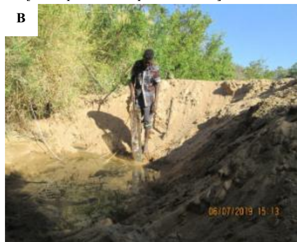
Figure 2: a) A hand-dug well on the riverside in Matedza village; b) river waterhole in Matedza village