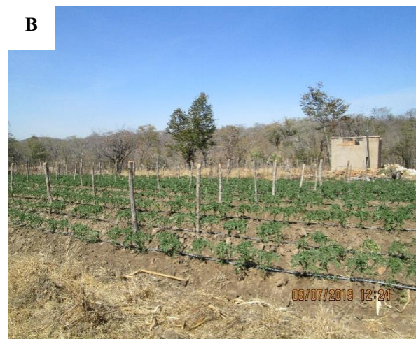
Figure 1. a) Vegetable Field; b) Tomato Field