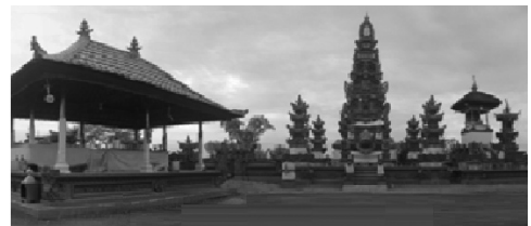
Fig. 2 Pura Agung Surya Bhuvana

In addition to the current management of the parties involved, the temple founders also held meditations to get a blessing on the three locations when they meditated on this skyline hill, there was a very large light falling on this place, so this place was considered