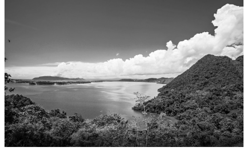
Fig. 1 Natural view of Yotepa Bay from the skyline hills

Taking into account the increasing number of Hindus, since 1979 the Jayapura Hindu leaders agreed to build a temple as a place to carry out religious, social and educational activities. Initially, it was agreed that the temple would be erected on a hillside near Base G beach, but did not receive customary approval. After that, the plan to establish a temple that moved around the Bukit Dok II was also not approved by custom. Finally, the plan to establish