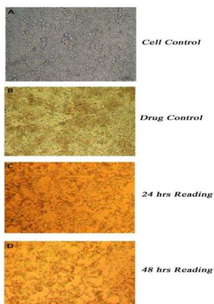
Figure 3: Cytotoxicity Effect of Aeglemarmelos extracts on MDCK cell Line