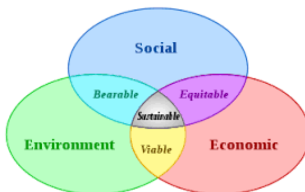
Figure 4. Pillars of Sustainable Development

There are two types of CSR concepts, namely in a broad sense and in a narrow sense. CSR, in a broad sense, is closely related to the goal of achieving sustainable economic activity. The sustainability of economic activities is related to social responsibility and accountability to society, the nation, and the international community. The company's social responsibility process will not be far from the concept of sustainable development. Because using the concept of sustainable development will have a long-term effect on the company itself. It takes the role of stakeholders, such as quality communities, to create good conditions between the beneficiary and the beneficiary and the quality and quantity of the community around the company itself (Nayenggita, Raharjo, and Resnawaty 2019).