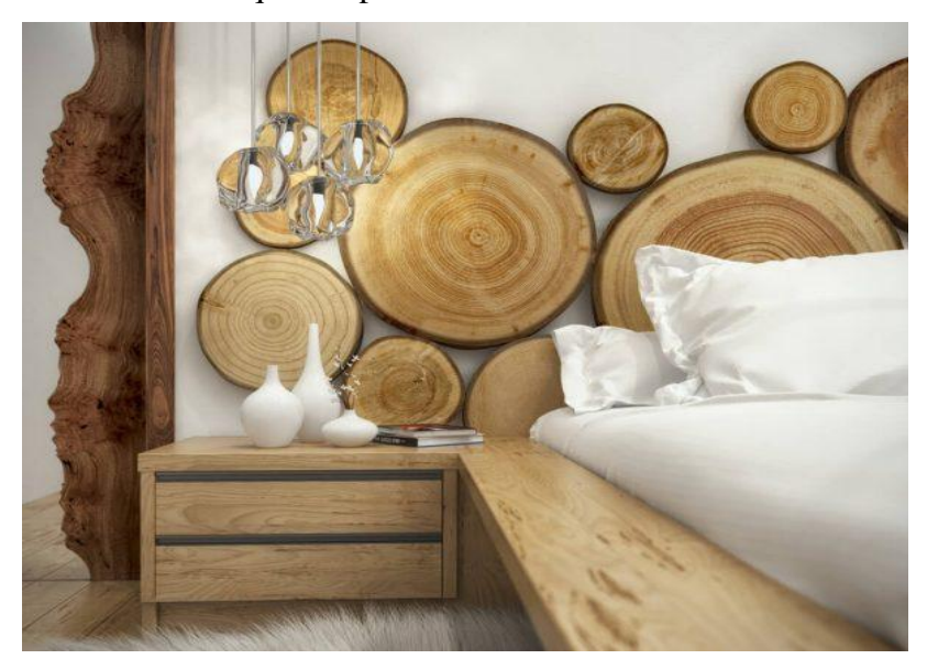
Wood cuts for bedroom decor

Finishing the ceilings of carriages or beams allows not only to penetrate the interior of warmth and comfort, but also to solve the problem of sound insulation. Usually a lining or beam is used. For walls, most often, block house opening and decorative panels. They are distinguished by their special structure and good thermal insulation properties. The panels are made from valuable wood species and are considered quite expensive.