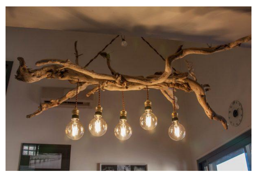
Designer chandelier from driftwood

Wooden furniture. Wood, like no other material, is suitable for the manufacture of cabinet and upholstered furniture. Now the trend is furniture with knots, cracks, artificially aged, with the effect of "craquelure". Some items are even sawn from solid pieces of wood, but the cost of such products is usually high. They also make furniture from old stumps, bark, combine wood with leather, velour. Such household items serve for a long time, creating a special, useful microclimate in the house for a person and allowing you to feel a unique aroma.