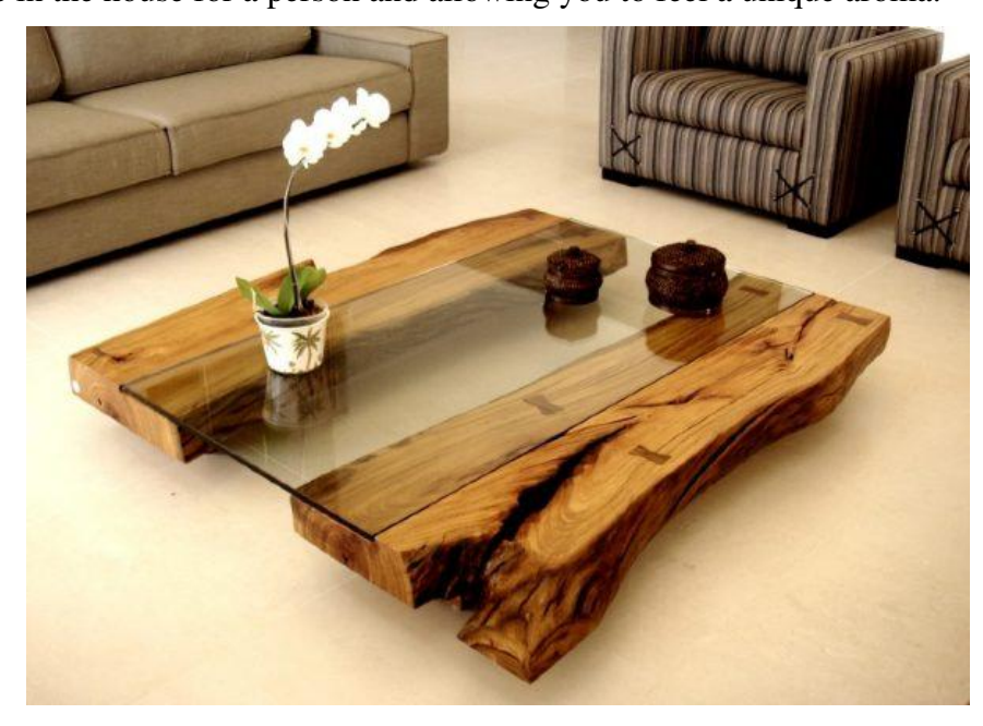
Original coffee table made of tree trunks

Wooden furniture. Wood, like no other material, is suitable for the manufacture of cabinet and upholstered furniture. Now the trend is furniture with knots, cracks, artificially aged, with the effect of "craquelure". Some items are even sawn from solid pieces of wood, but the cost of such products is usually high. They also make furniture from old stumps, bark, combine wood with leather, velour. Such household items serve for a long time, creating a special, useful microclimate in the house for a person and allowing you to feel a unique aroma.