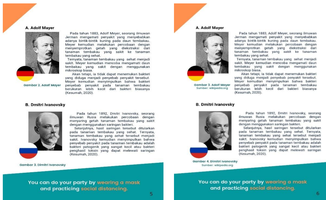
Pages before revision

The cover display is given a lot of advice by the validator, especially regarding the background color and images that are relevant to the material. Furthermore, the background of the content page is also asked to be revised so that the writing is clearer.