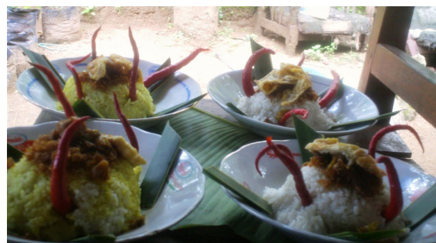
Figure 9. Asahan .

The other side dishes are served jenggareng , (black soybeans, peanuts, and beans). Besides that, there are tempe goreng , gereh petek goreng , sruhendeng ,