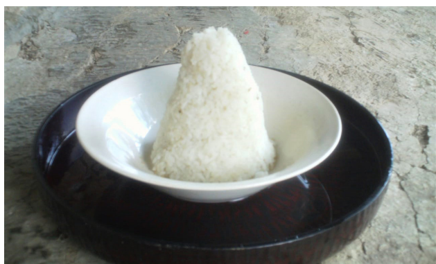
Figure 4. Tumpeng Gung .

As described in the sub-section on the meaning, the Javanese believe that, for people who die on an even day, the salvation offerings need to be supplemented with tumpeng gung . This is in accordance with the calculation of “ gunung-guntur-segara-asat ,” (i.e., if the calculation results in an even number, it means guntur ‘thunder’ and asat ‘drought’, so special offerings need to be made to avoid danger and a lack of fortune). Hence, the serving of tumpeng gung is related to the hope that wong sing ditinggal aja asat rezekine means that the people left behind would not lack of fortune, so their fortune would always be agung , which means abundant.