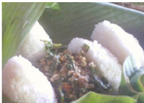
Figure 2. Tumpeng Ungkur-Ungkur .

Undur-undur is a food made from rice that is formed like a cone, but the cone is made similar to the form of an antlion. The use of srundheng during the frying