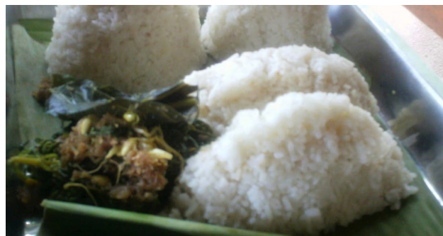
Figure 3. Undur-Undur . Source: The writer's documentation of a death ceremony in Wonogiri Regency