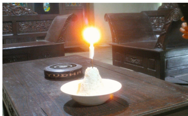
Figure 7. Tumpeng Obor .