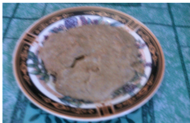
Figure 10. Jenang Sepuh .

Respect for parents or elders could also be seen from the level of speech in the use of the Javanese language. In the levels of formality in the Javanese the language, aside from the level ngoko , there is also level called karma , which is also used to talk to people who are older than the speaker. According to Bastomi (1995: 46–47), in the view of Javanese people, parents, elderly