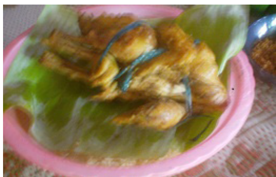
Figure 8. Sekul Suci .

To add value or weight to the purity of sekul “rice” in the making or cooking of the sekul suci , the cooks are either holy or have done wudhu (ritual ablution before prayers); in this respect, there is no denying that wudhu is one of the purifying ways in the teachings of Islam.