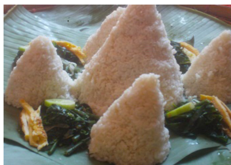
Figure 5. Tumpeng Krumpul . Source: The writer’s documentation of a death ceremony in Wonogiri Regency, Central Java