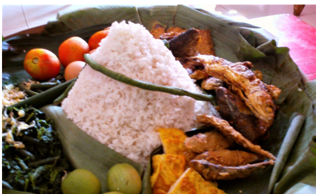
Figure 6. Tumpeng Marga Pakewuh .

Having tumpeng obor/oncor in a death memorial or salvation ceremony as a symbol of the request to obtain pepadhang could also be an explanation for the inclusion of Islamic elements in Javanese culture. Tumpeng oncor is a symbol of lighting. When a person starts to enter the grave, the body would face a new nature. Here, yen padang dudu padange awan yen peteng dudu petenge wengi means that bright is not bright of the day, and dark is not dark of the night. That is nature’s grave. Feelings of dark and bright depend on the deeds a person has done in the world.